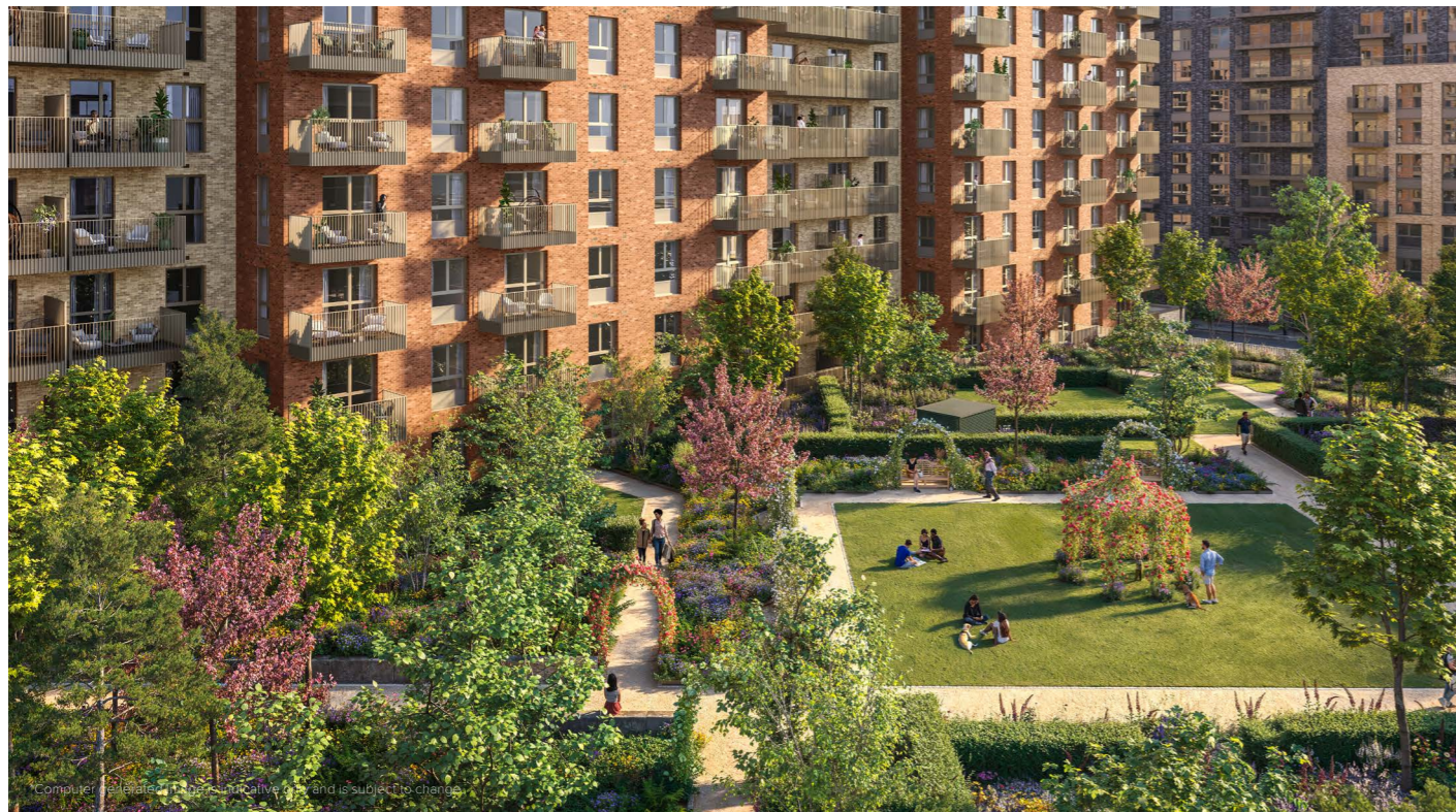
Computer generated image for illustrative purposes only and is subject to change