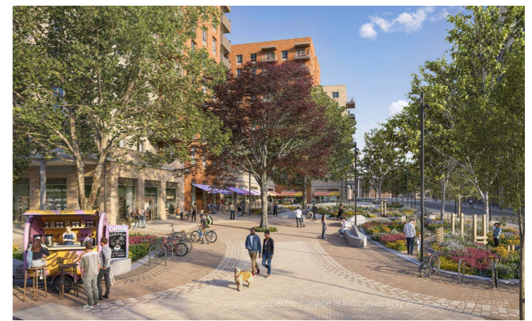
Computer generated image for illustrative purposes only and is subject to change

Individual photo identification for at least two directors and shareholders.