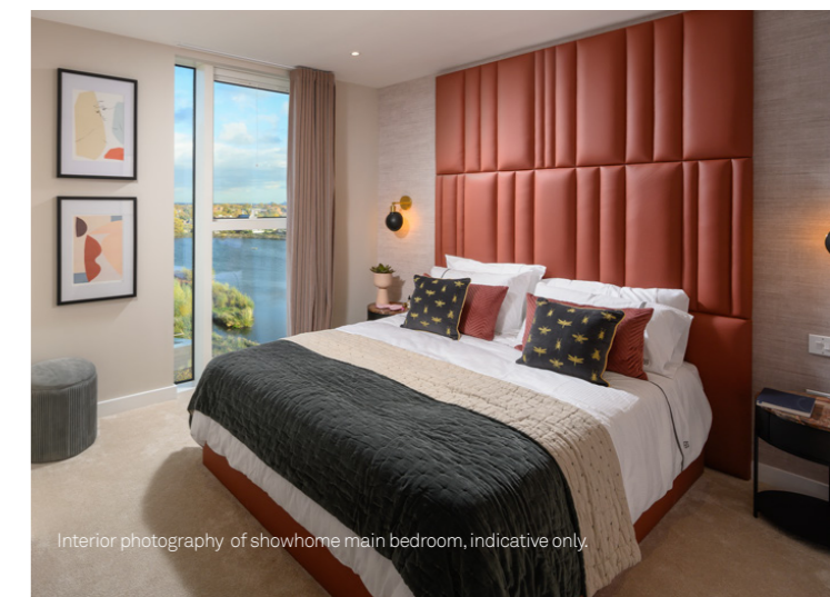
Interior photography of showhome main bedroom, indicative only.