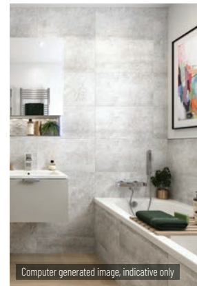
Computer generated image, indicative only