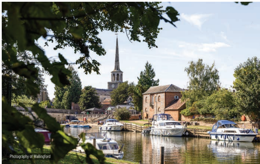
Photography of Wallingford