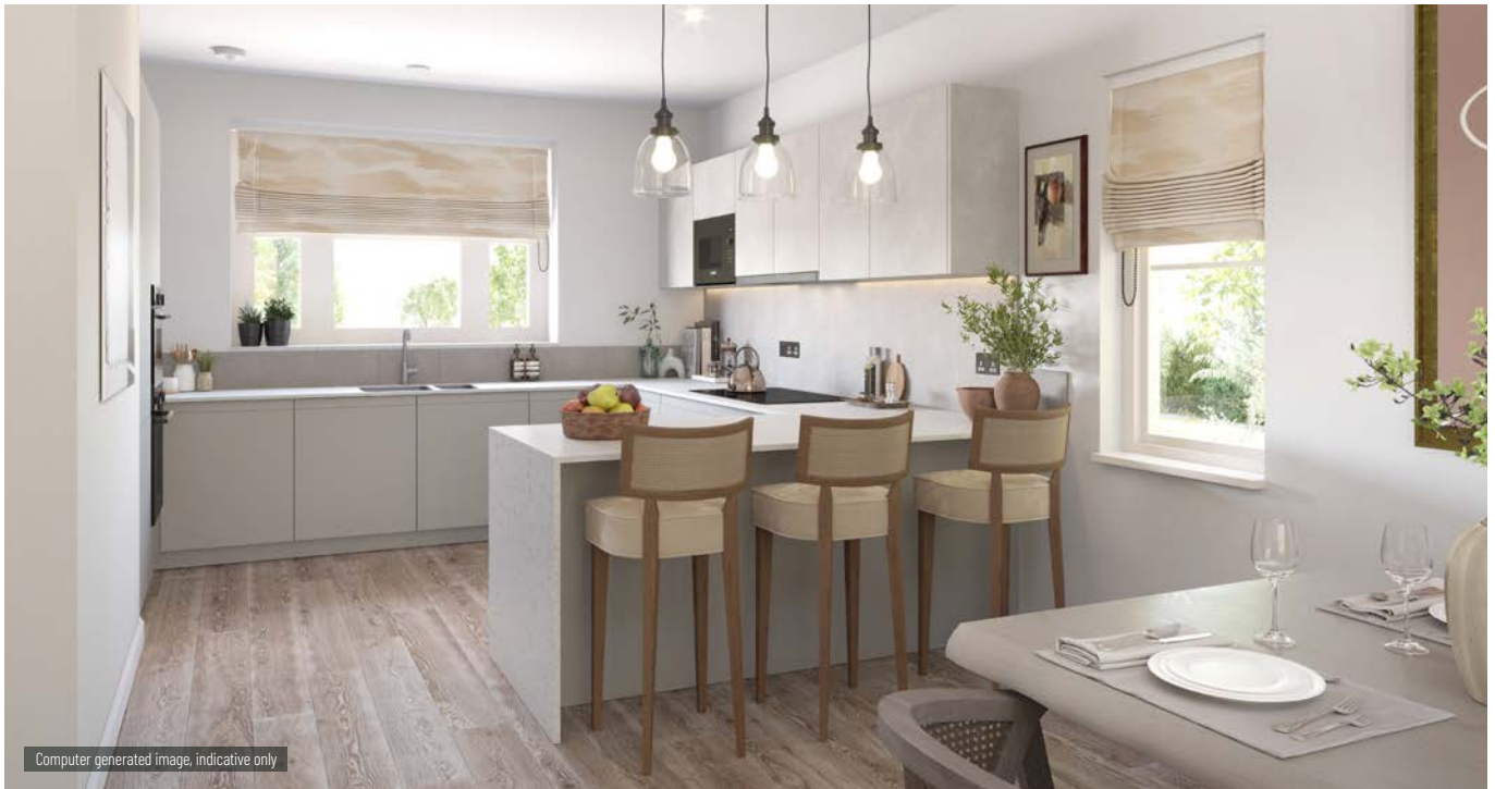
Computer generated image, indicative only