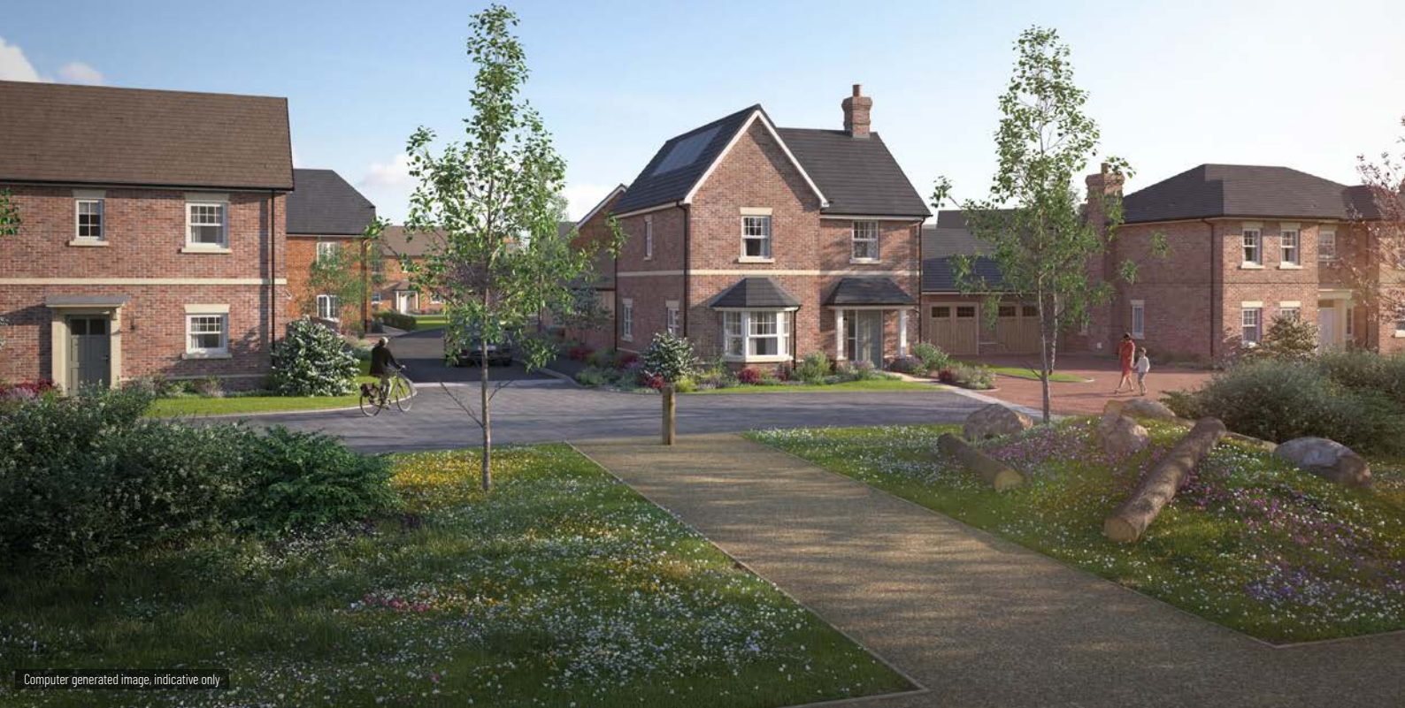
Computer generated image, indicative only