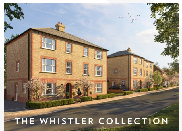
THE WHISTLER COLLECTION

ONLY 4 REMAINING. 4 BEDROOM HOMES READY TO MOVE INTO EARLY NEXT YEAR (Q1/Q2 2023)