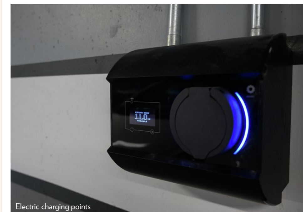
Electric charging points