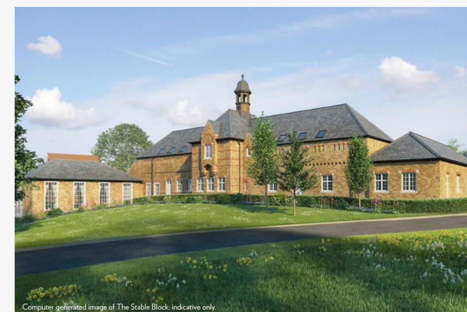
Computer generated image of The Stable Block, indicative only.

One of the newest phases at Trent Park, due to launch this year, The Stable Block is rich in character and is a significant part of Trent Park's conservation. It has direct links to the estate's past – the block was built in the late 18th century by Sir Richard Jebb and was extended in the late 1860s in Victorian gothic style to form the courtyard. The new phase will comprise of two and three-bedroom refurbished apartments and four-bedroom duplexes, with access to a private courtyard.