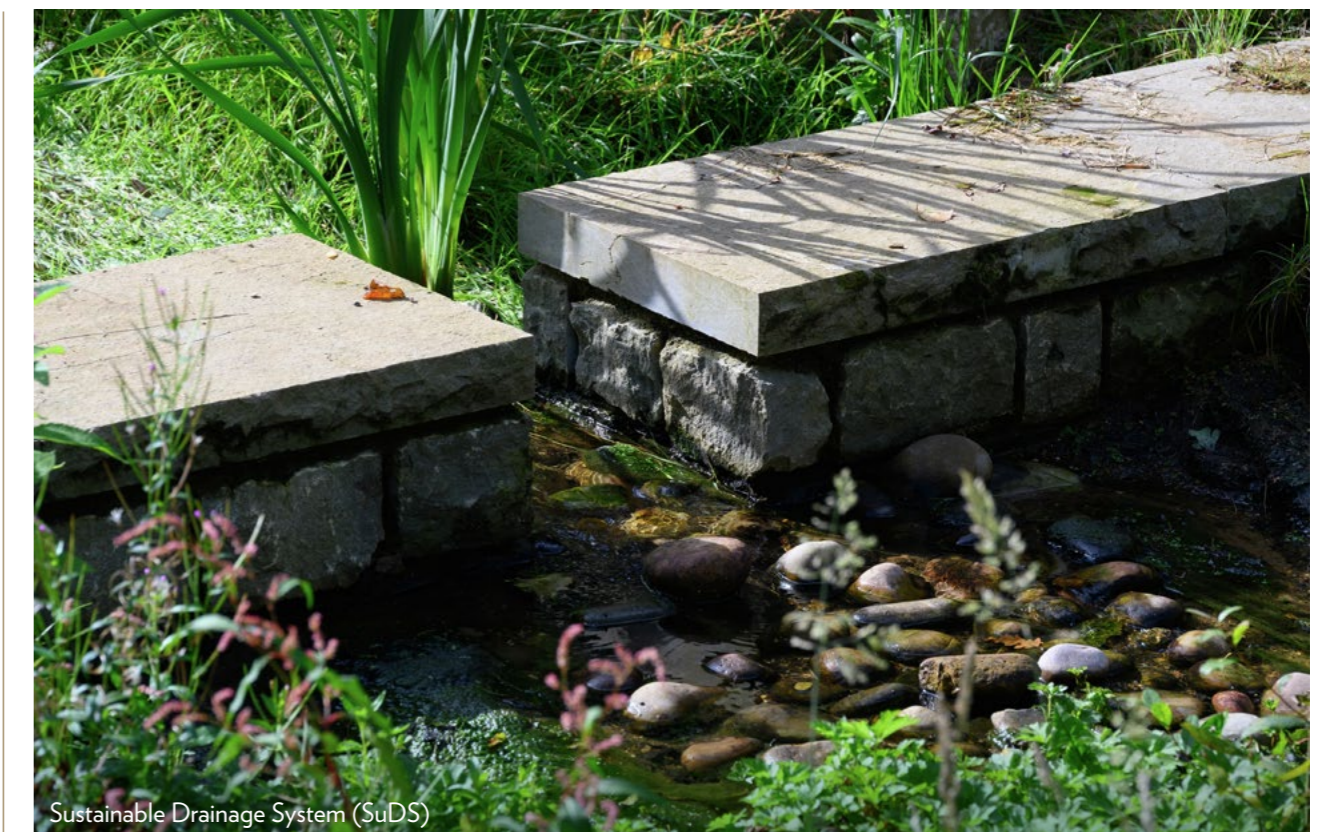
Sustainable Drainage System (SuDS)

Trent Park is a fantastic place to live because of all the open green space. You only need to go out of your front door to enjoy the beautiful nature and landscaping. If you want to feel like you are in the countryside yet enjoy going into London, it's the perfect place to live.