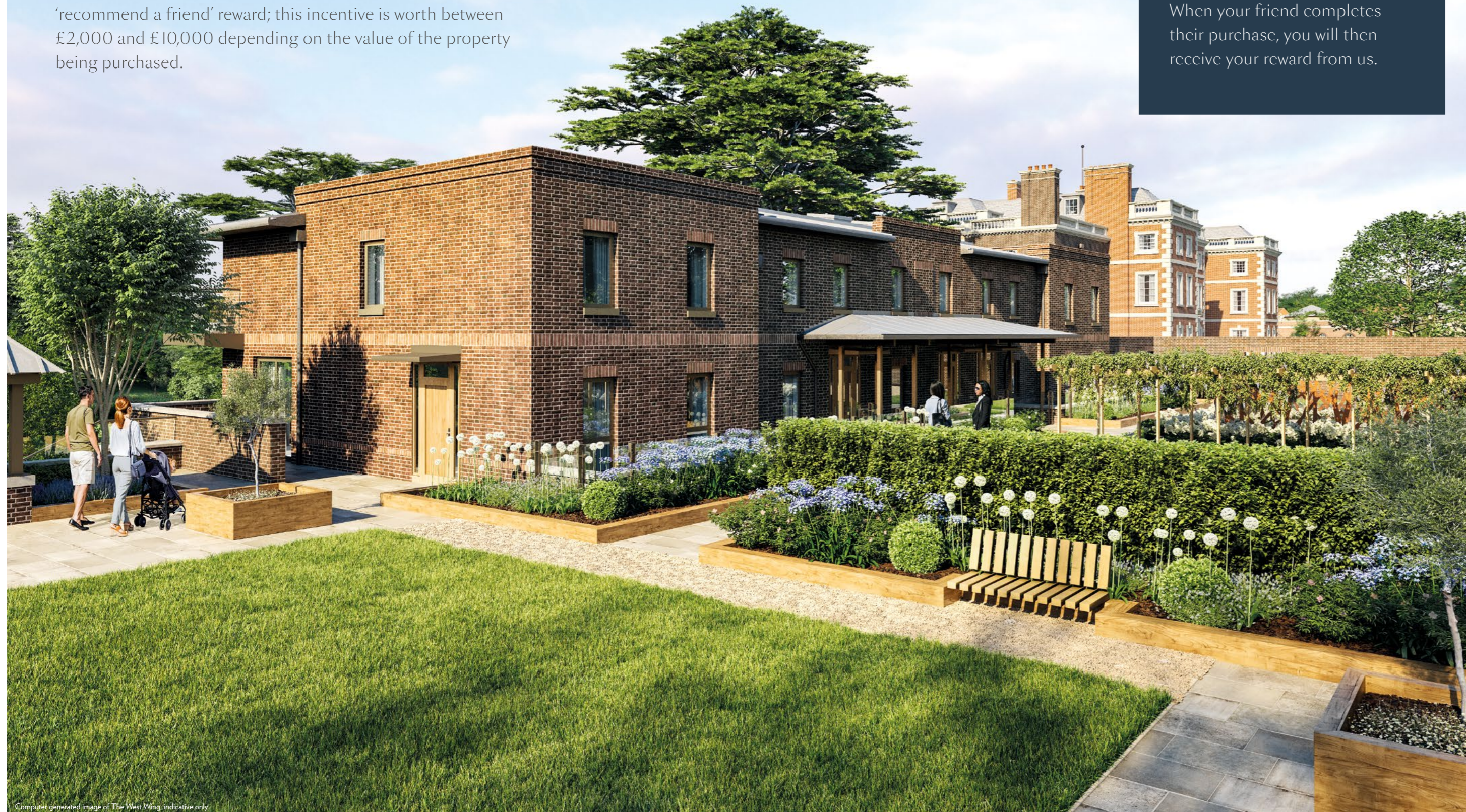
Computer generated image of The West Wing, indicative only

When your friend completes their purchase, you will then receive your reward from us.