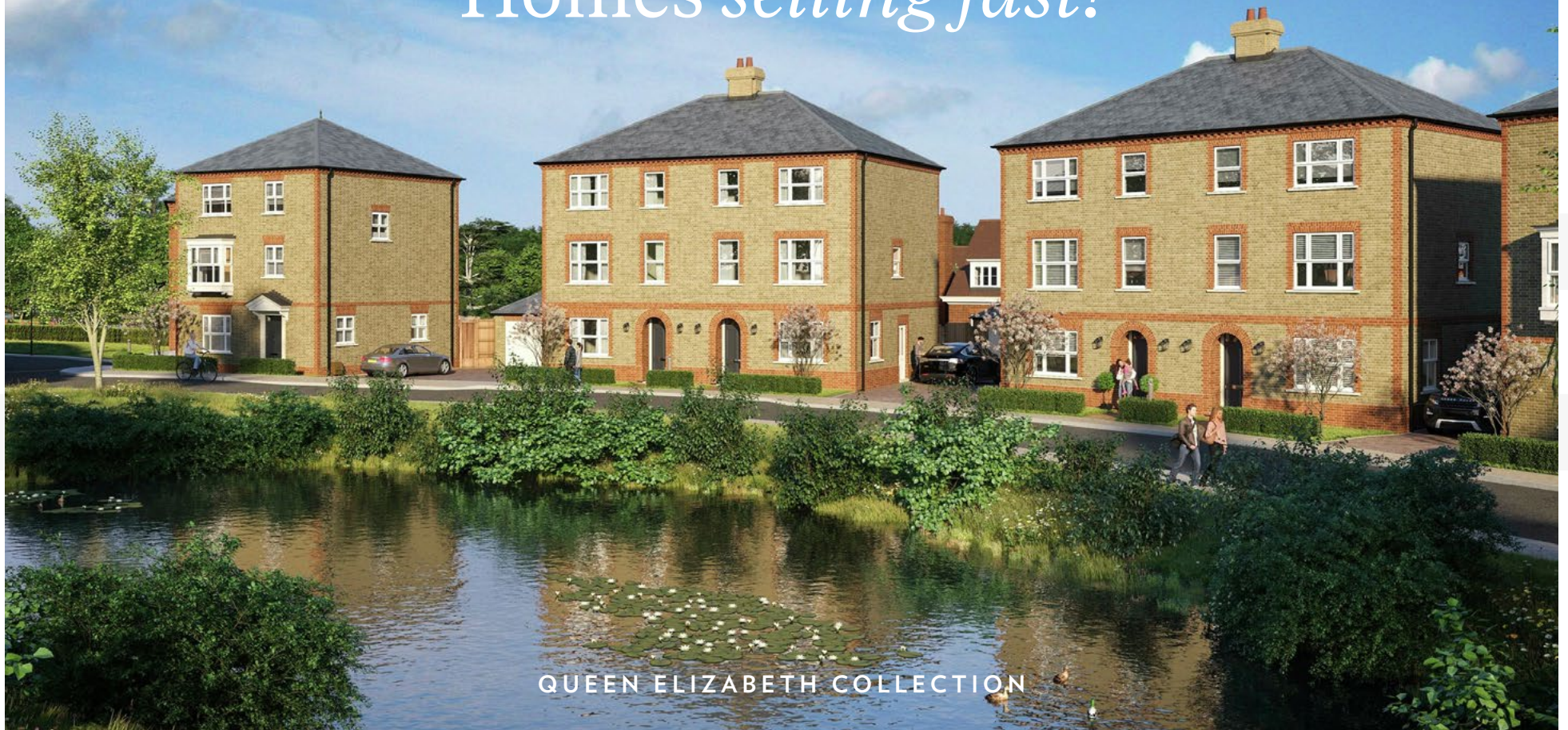
QUEEN ELIZABETH COLLECTION

LAST TWO HOUSES REMAINING. COMPLETING AND READY TO MOVE INTO Q3/Q4 THIS YEAR