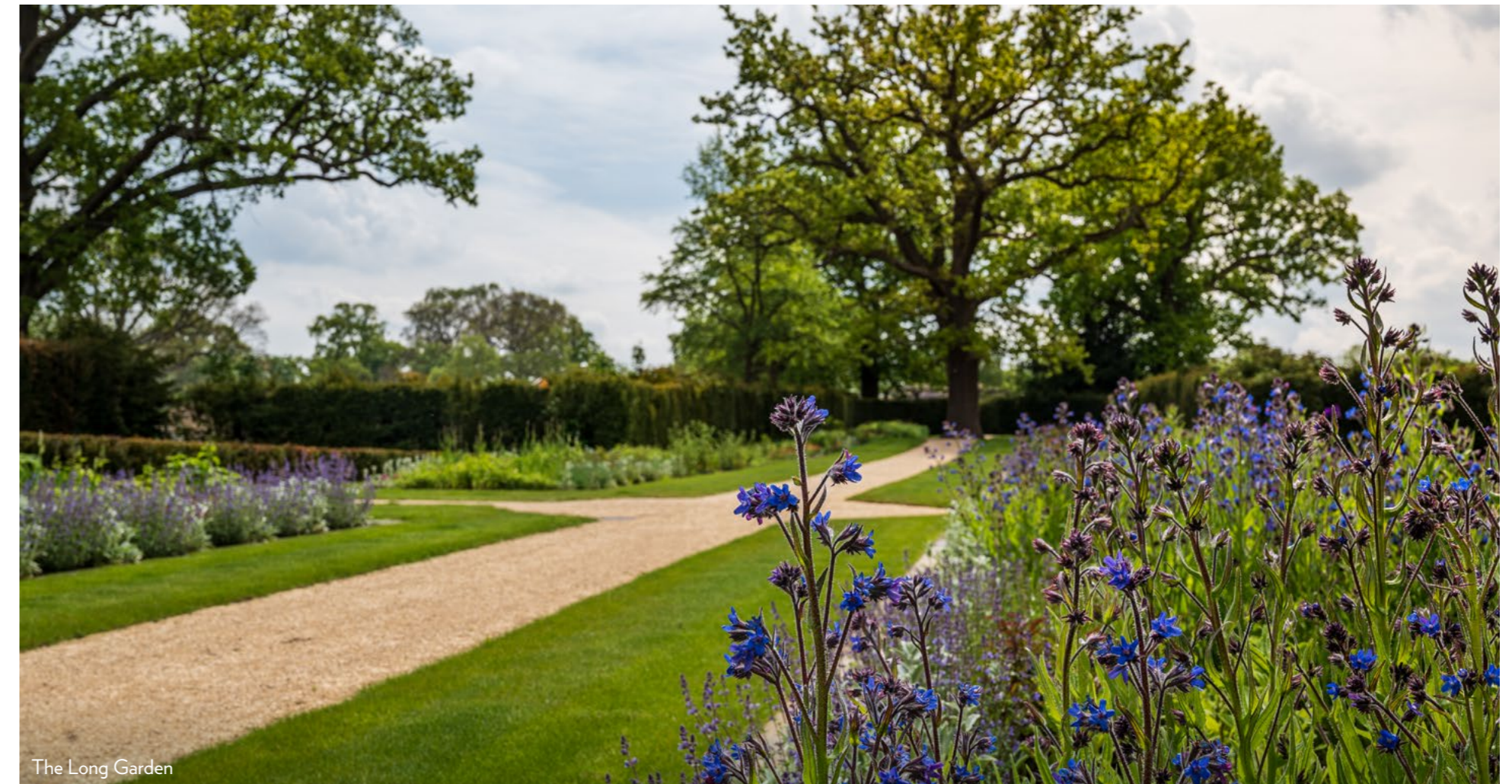
The Long Garden

My biggest challenge at Trent Park is managing the protected species and ensuring their populations can thrive here. We have bats and Great Crested Newts at Trent Park, which require careful care and management.