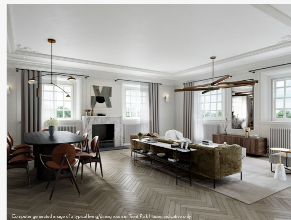
Computer generated image of a typical living/dining room in Trent Park House, indicative only.

and admire the beautiful sights of the vibrant pergola entwined with wisteria, take a moment to appreciate its illustrious history; it was first installed in 1912! You can also check out our last newsletter where we spoke with our landscaping team, Elite Landscapes, to find out more about the hard work that goes into Trent Park's landscape.