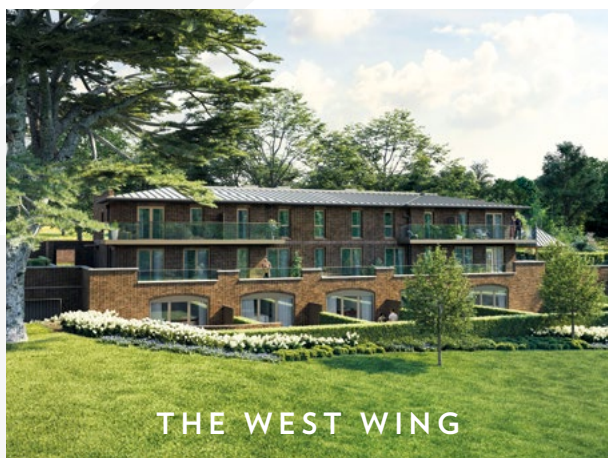
THE WEST WING

ONLY 2 LEFT. READY TO MOVE INTO EARLY NEXT YEAR (Q1/Q2 2023)