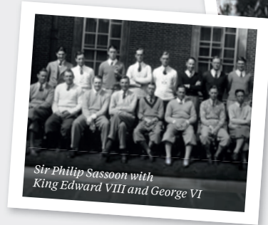
Sir Philip Sassoon with King Edward VIII and George VI