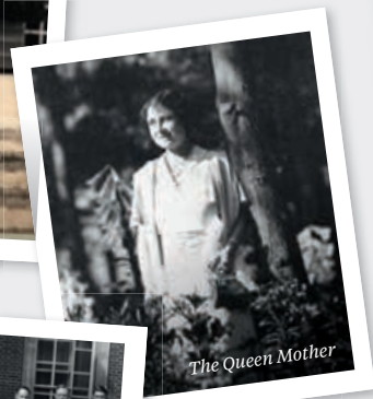
The Queen Mother