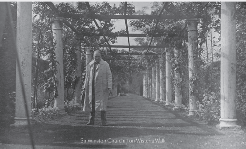
Sir Winston Churchill on Wisteria Walk

A GUIDE AND INSIGHT INTO TRENT PARK'S RICH HISTORY