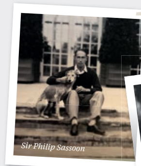
Sir Philip Sassoon