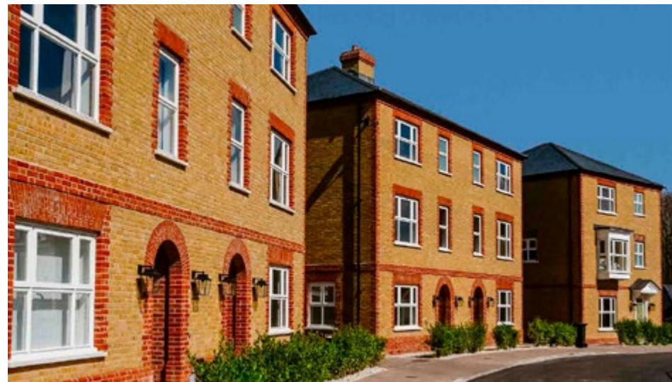
4 bedroom family home overlooking the natural pond THE QUEEN ELIZABETH COLLECTION

This five-bedroom Cooper house is fully furnished by Berkeley's interior designers and is the final home available at The King George Collection. The house is located just moments from the outdoor pool, gym and restored Long Garden.