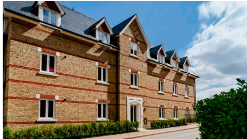
Contemporary two-bedroom apartments AT CARLTON HOUSE

The two-bedroom, two bathroom apartment at Highfield House is the last remaining home in this building. The spacious apartment is fully furnished by Berkeley's interior designers, and overlooks the historic Daffodil Lawn; the views of Trent Park House are stunning!