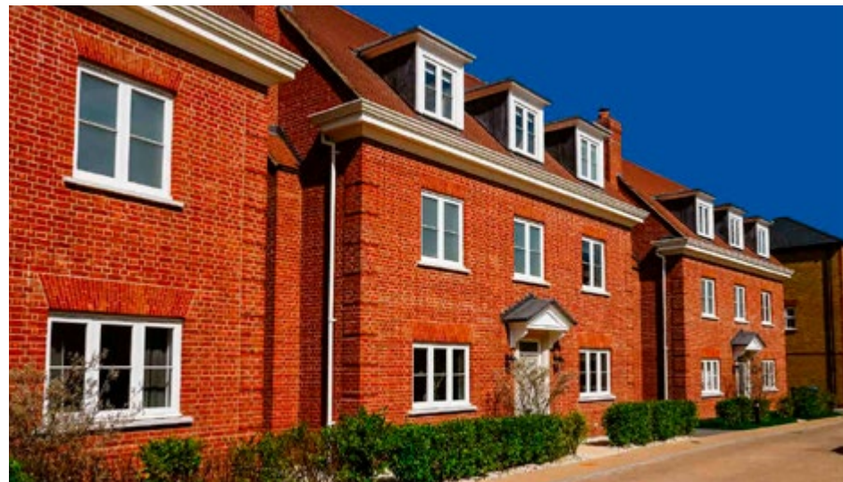
Last remaining home in KING GEORGE COLLECTION