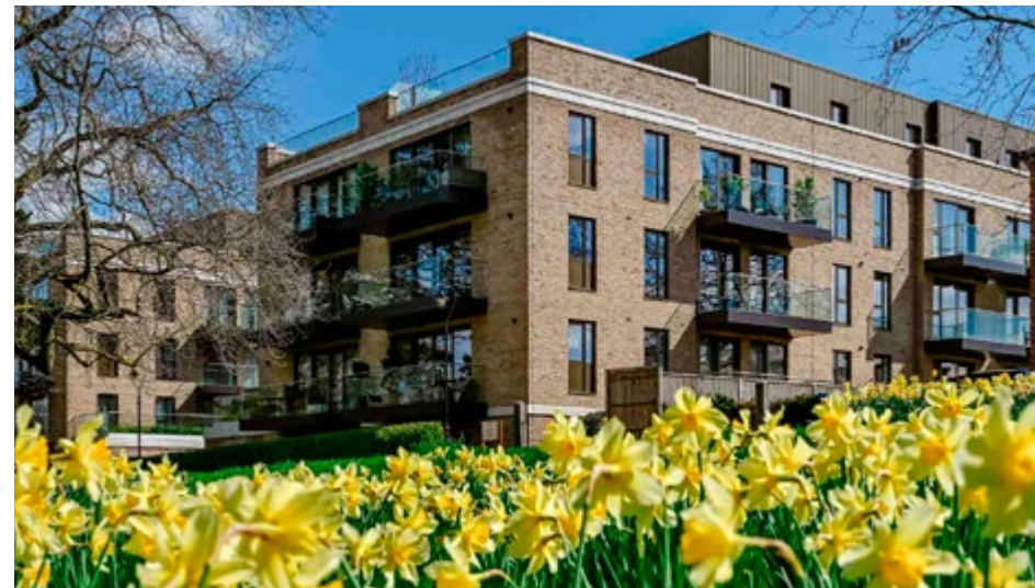
Fully furnished two-bedroom apartment AT HIGHFIELD HOUSE

Located within a quiet corner of the development and looking out over natural pond and fields to the front, this fabulous four double bedroom semi-detached family home is located over 3 floors. Complete with private driveway, adjoined garage and private rear garden, this property is perfect for a growing family!