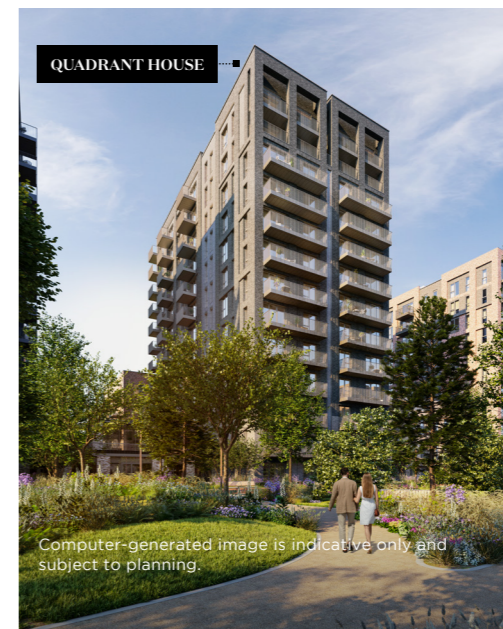
Computer-generated image is indicative only and subject to planning.