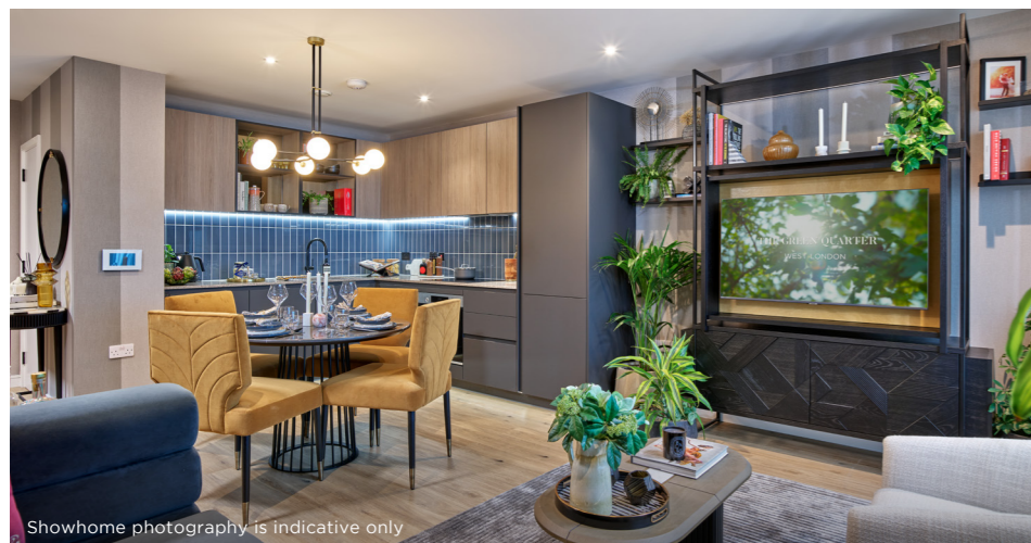
Showhome photography is indicative only