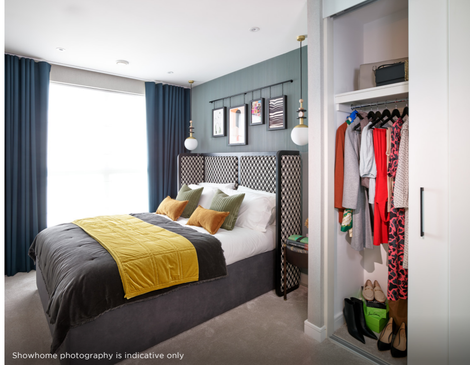
Showhome photography is indicative only