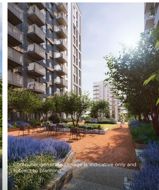
Computer-generated image is indicative only and subject to planning.