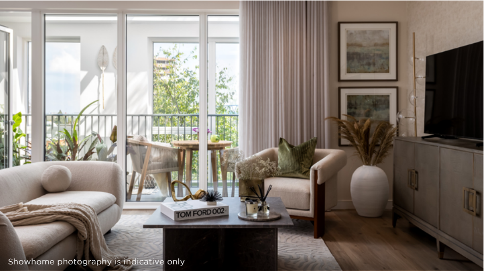
Showhome photography is indicative only

Quadrant House comprises 96 private sale apartments.