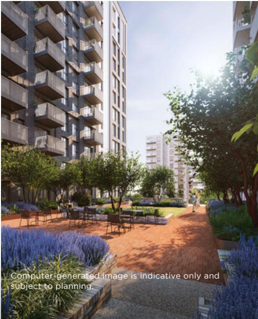
Computer-generated image is indicative only and subject to planning.