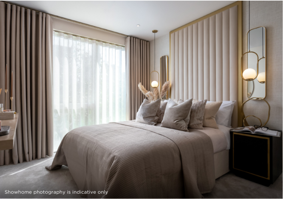
Showhome photography is indicative only