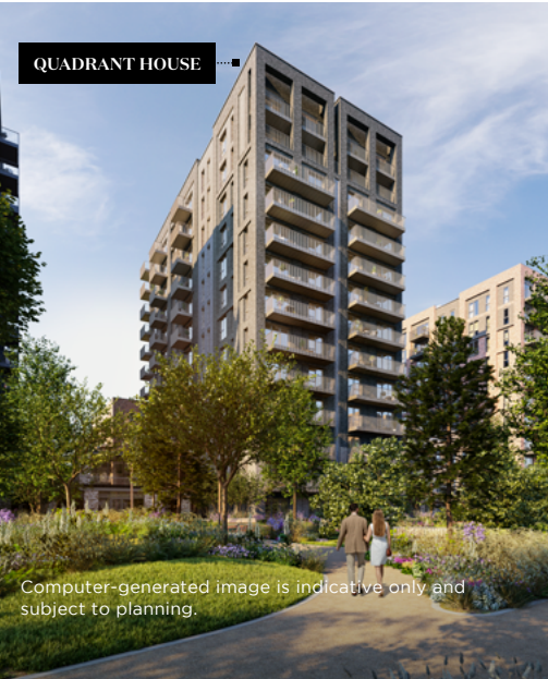
Computer-generated image is indicative only and subject to planning.