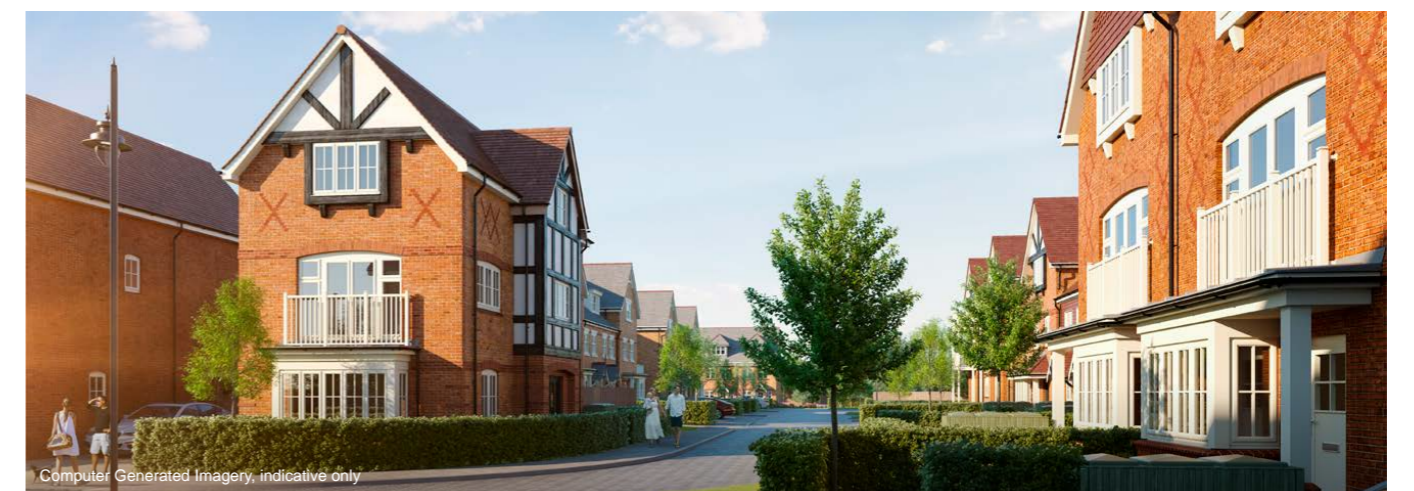
Computer Generated Imagery, indicative only