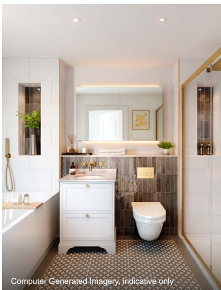
Computer Generated Imagery, indicative only