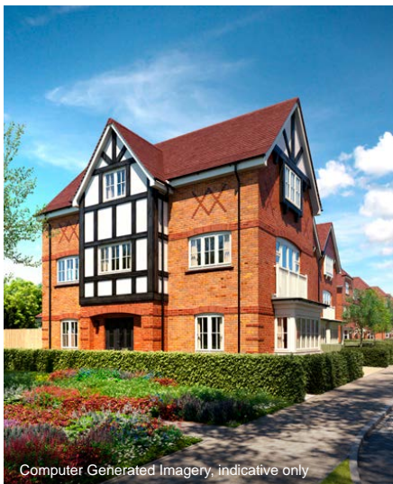
Computer Generated Imagery, indicative only