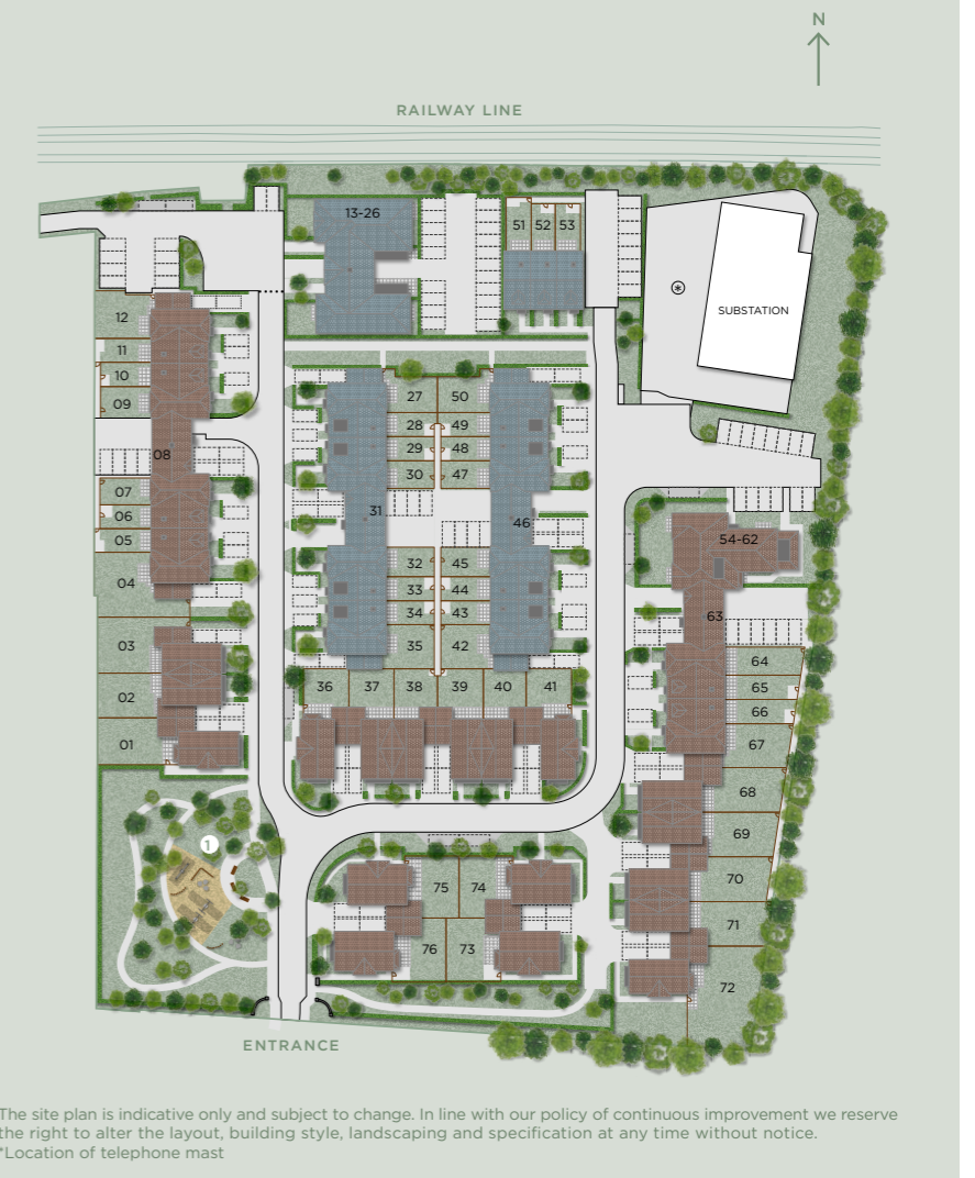
The site plan is indicative only and subject to change. In line with our policy of continuous improvement we reserve the right to alter the layout, building style, landscaping and specification at any time without notice. *Location of telephone mast

All the homes are designed with heritage detail and effortless elegance, creating a contemporary yet timeless finish.