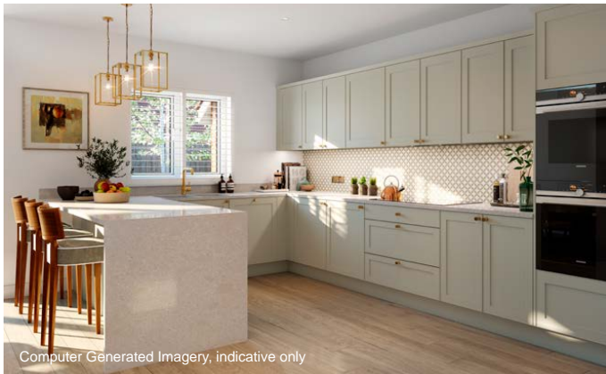
Computer Generated Imagery, indicative only