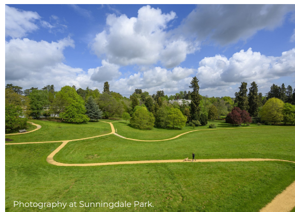
Photography at Sunningdale Park.