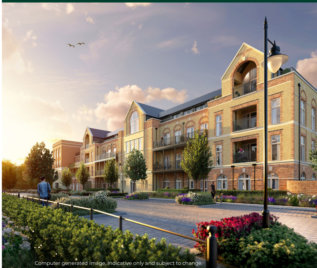
Computer generated image, indicative only and subject to change.