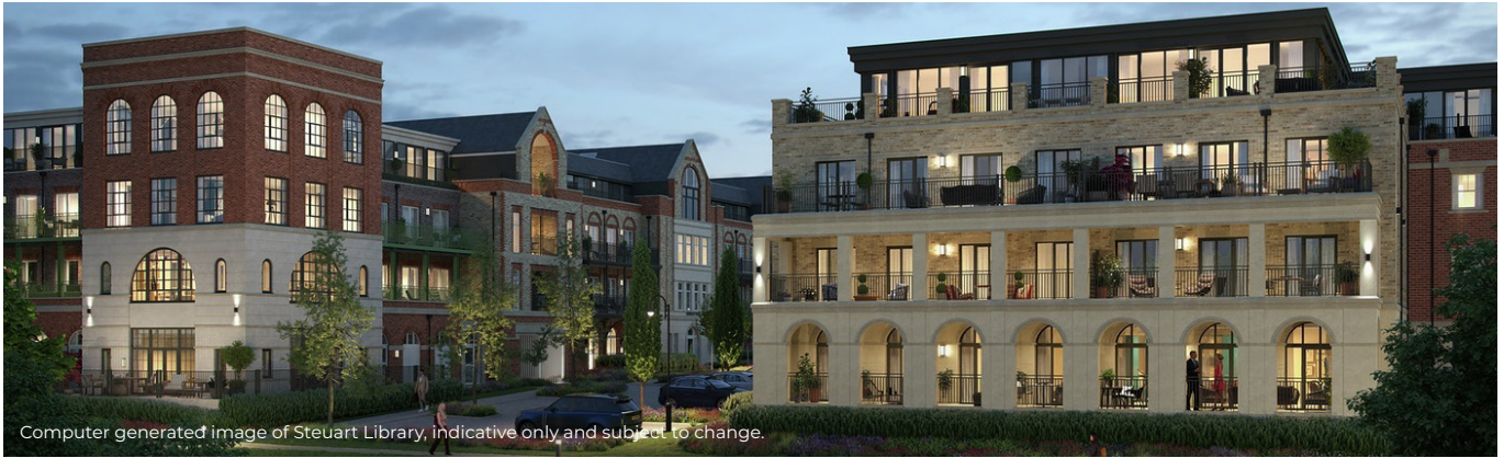
Computer generated image of Steuart Library, indicative only and subject to change.