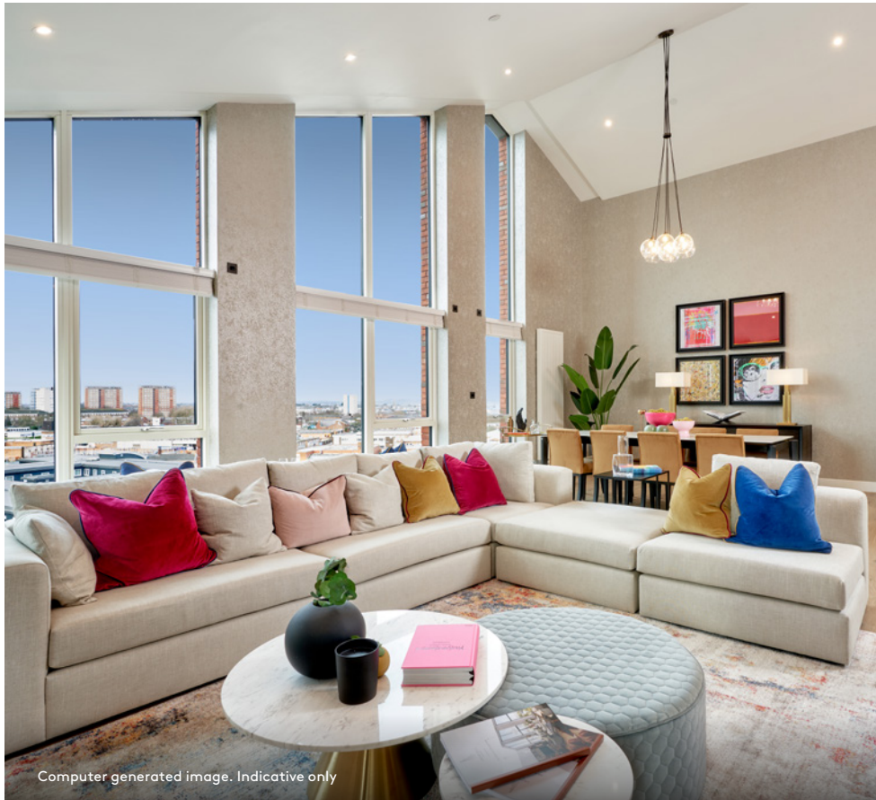
Computer generated image. Indicative only