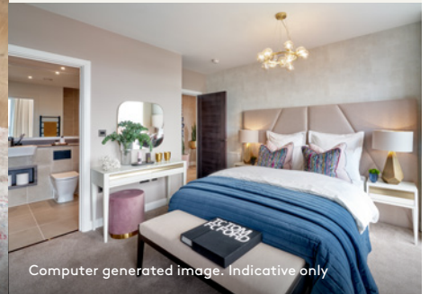
Computer generated image. Indicative only

As of 30th June 2022 Ground Rent became peppercorn.