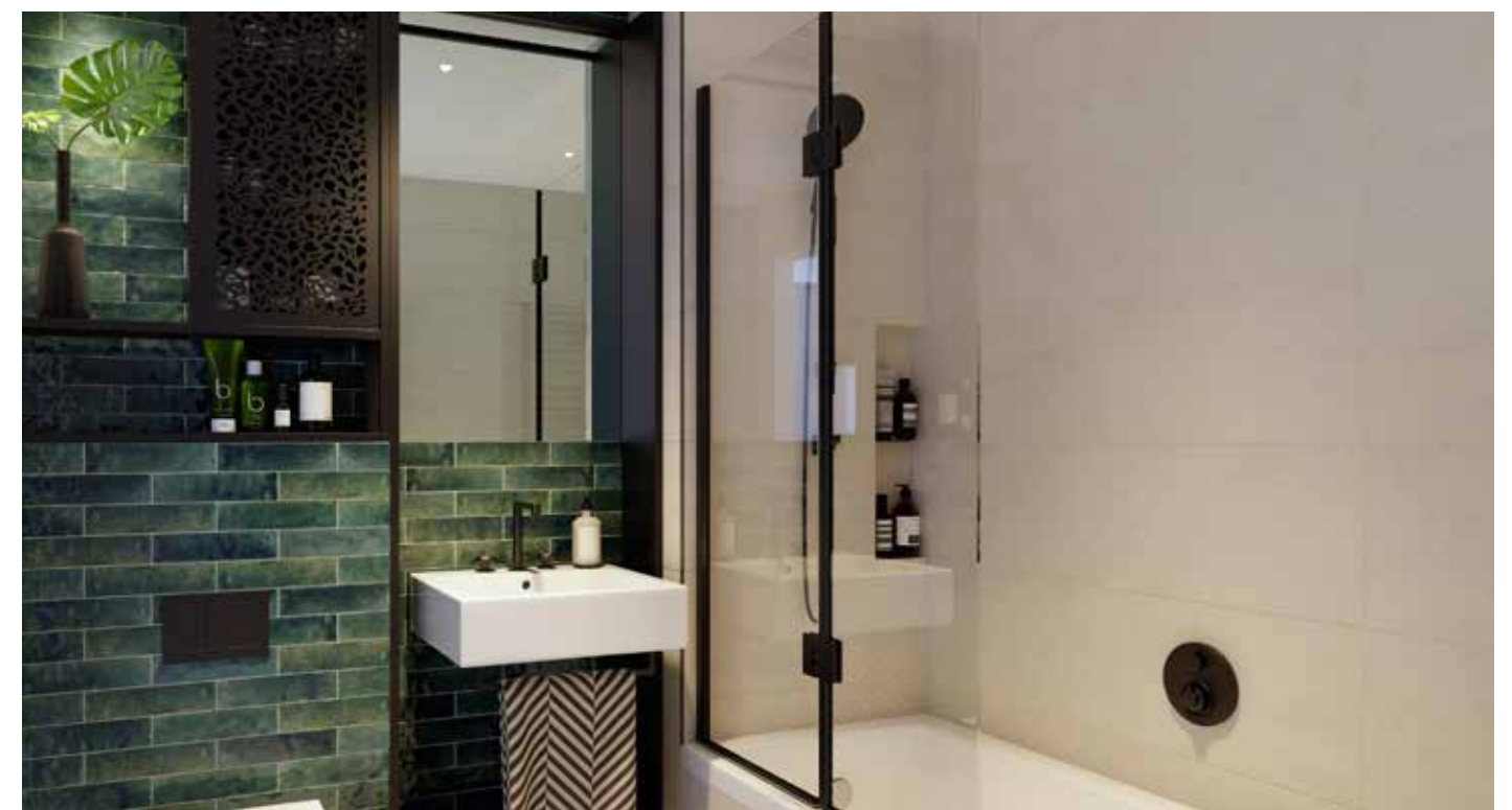
Computer generated image, indicative only.