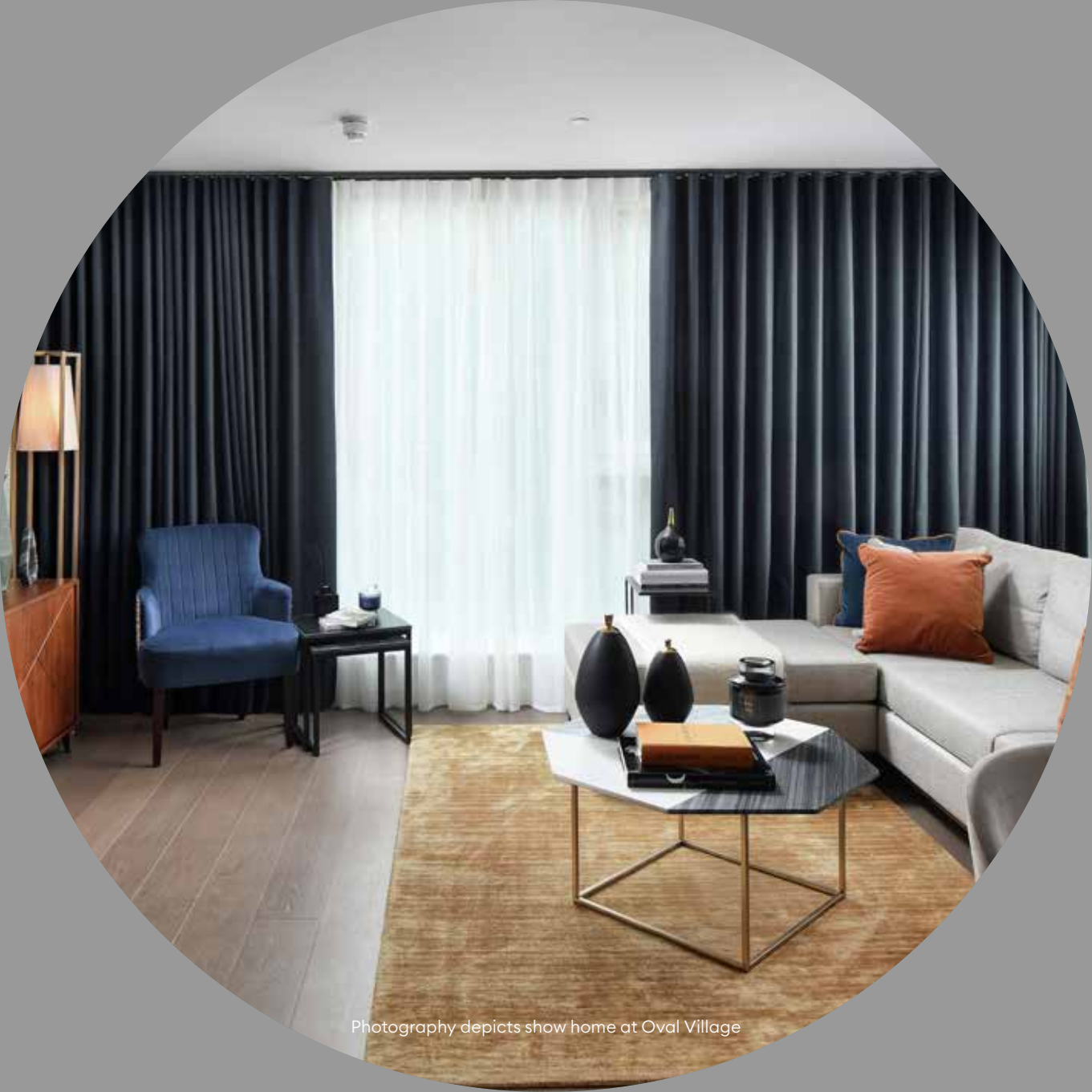
Photography depicts show home at Oval Village