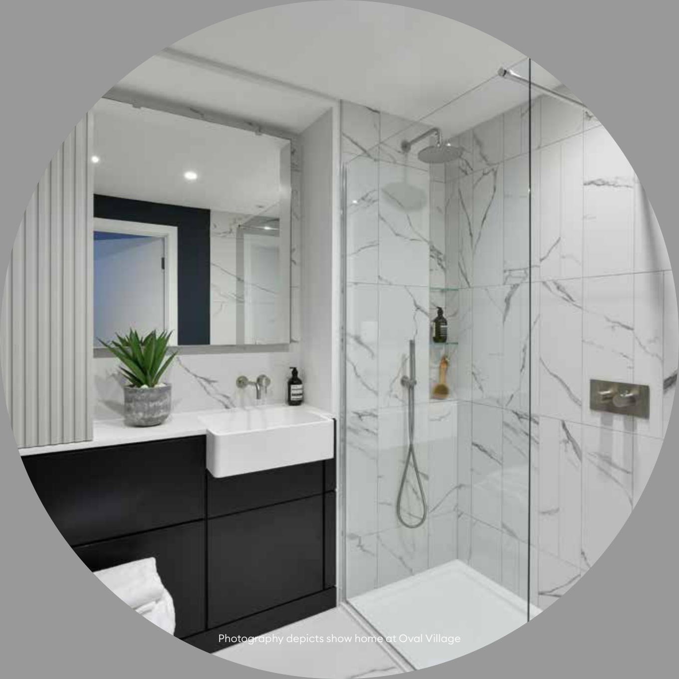
Photography depicts show home at Oval Village