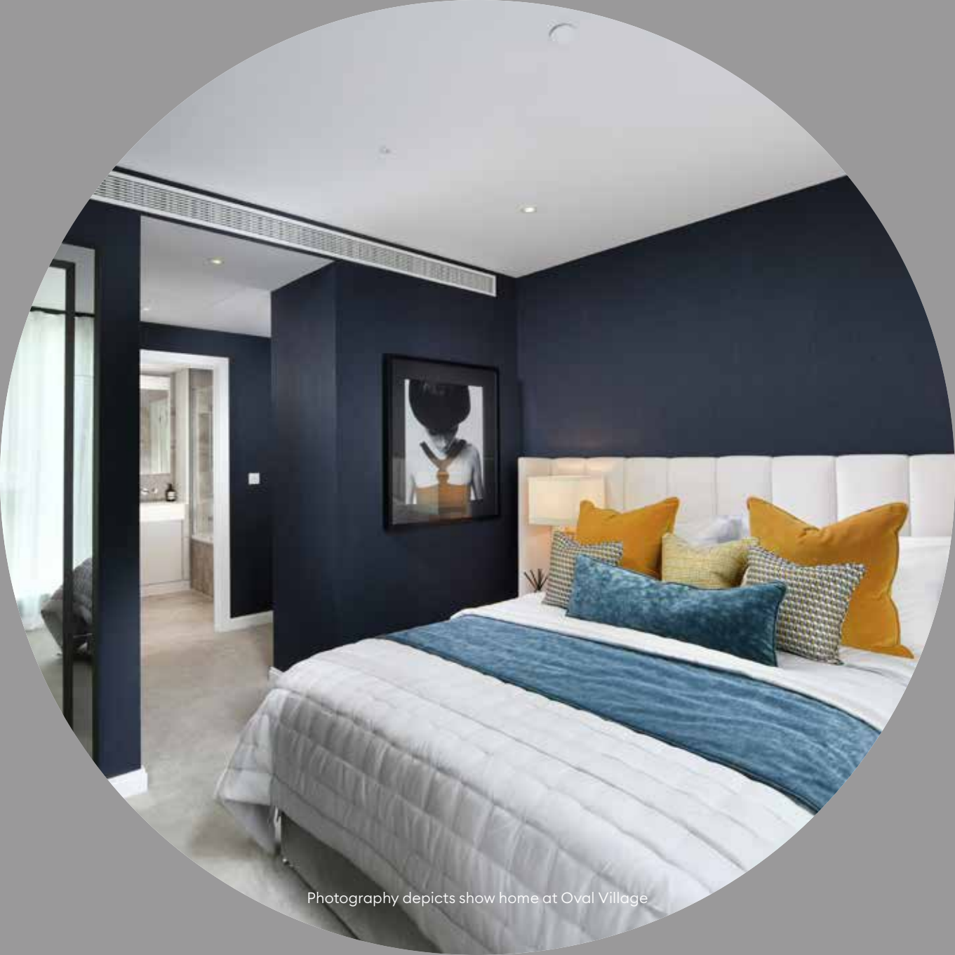
Photography depicts show home at Oval Village