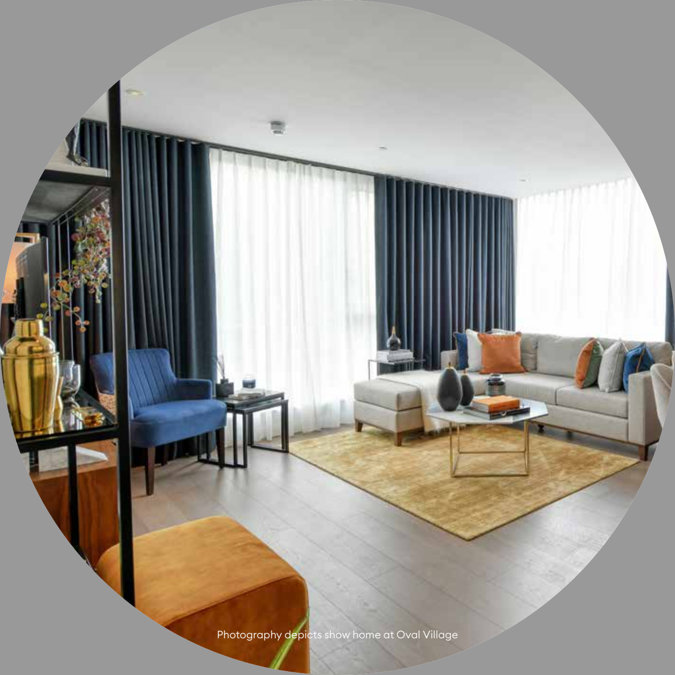
Photography depicts show home at Oval Village