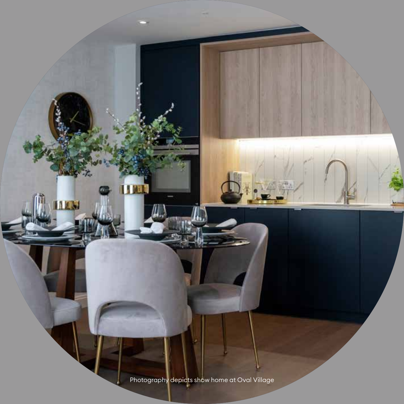
Photography depicts show home at Oval Village