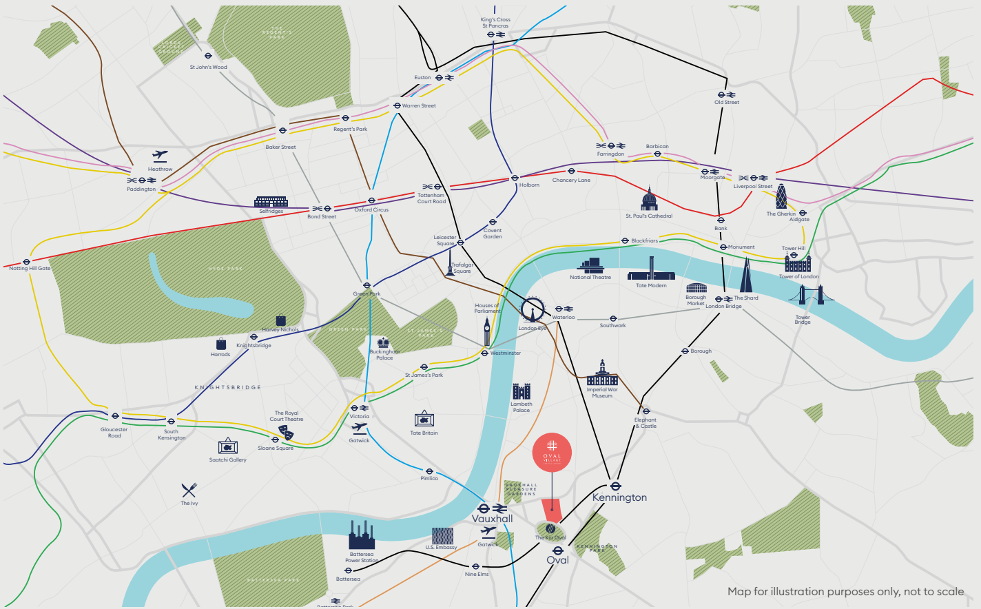
Map for illustration purposes only, not to scale.