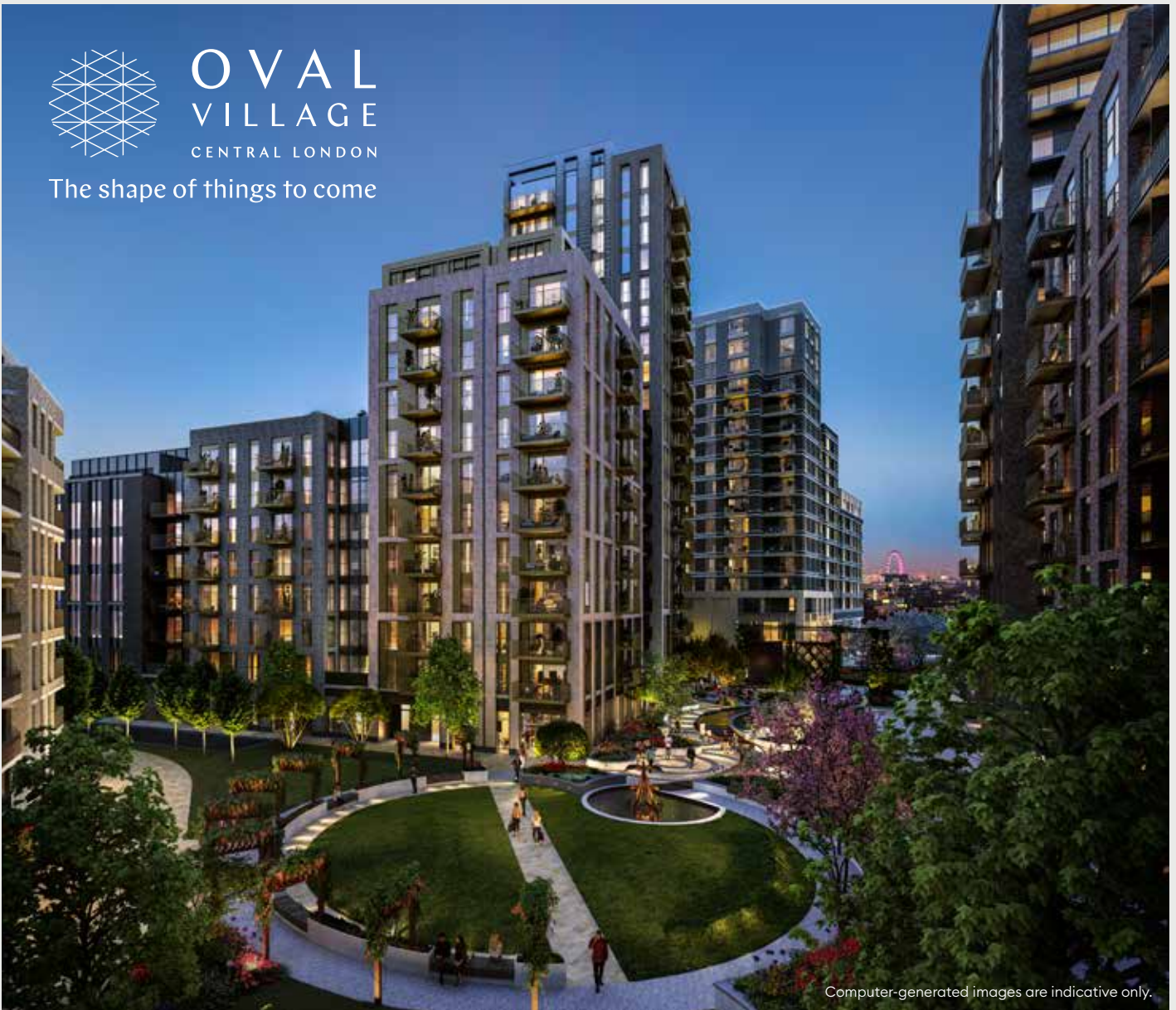
Computer-generated images are indicative only.