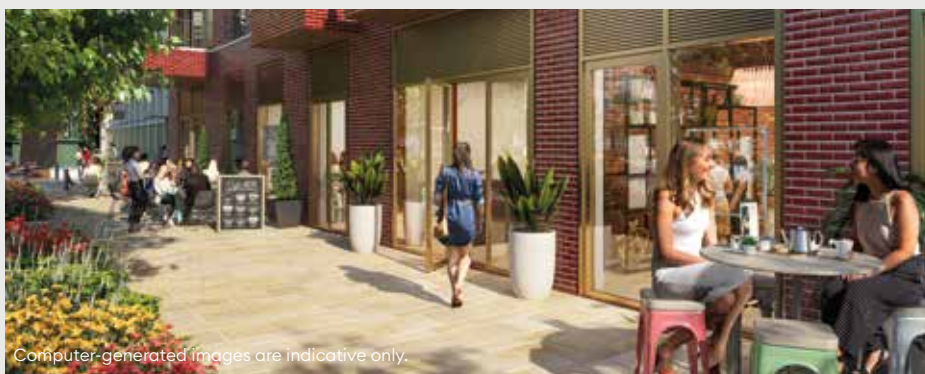
Computer-generated images are indicative only.