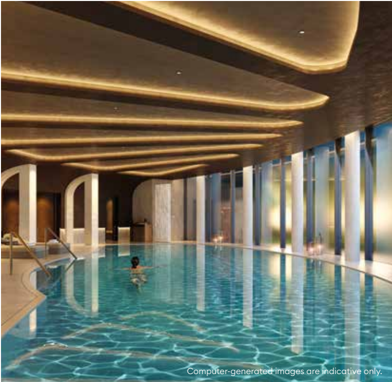
Computer-generated images are indicative only.