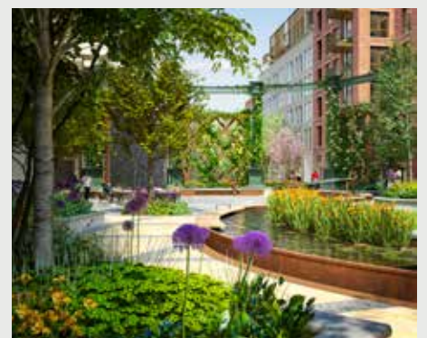
Computer-generated images are indicative only.