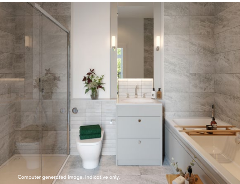
Computer generated image. Indicative only.