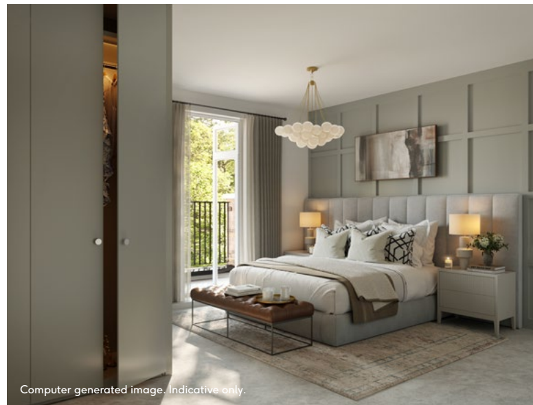
Computer generated image. Indicative only.