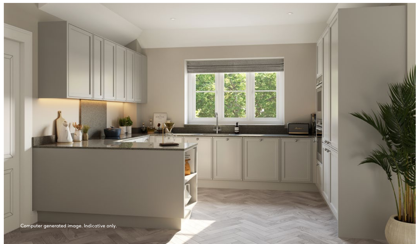
Computer generated image. Indicative only.