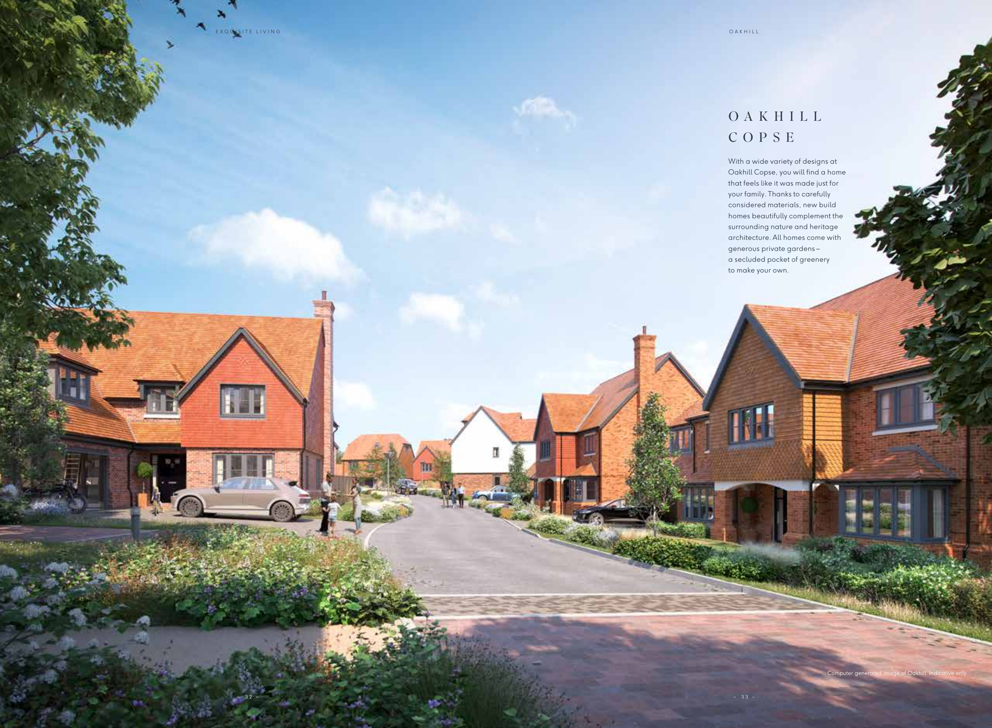
Computer generated image of Oakhill. Indicative only.

With a wide variety of designs at Oakhill Copse, you will find a home that feels like it was made just for your family. Thanks to carefully considered materials, new build homes beautifully complement the surrounding nature and heritage architecture. All homes come with generous private gardens – a secluded pocket of greenery to make your own.