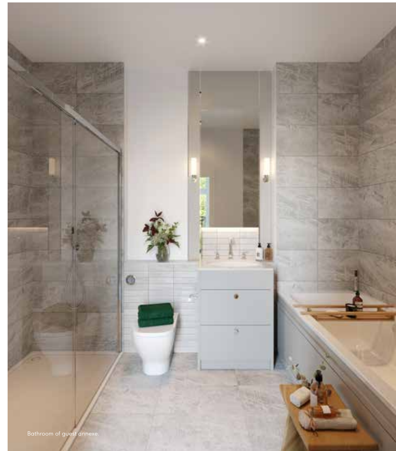
Bathroom of guest annexe.

The guest room annexe is a separate living space with its own entrance, an en suite bedroom, a workspace, and a kitchenette. Perfect for a nanny, teenagers or for when the grandparents come to stay.