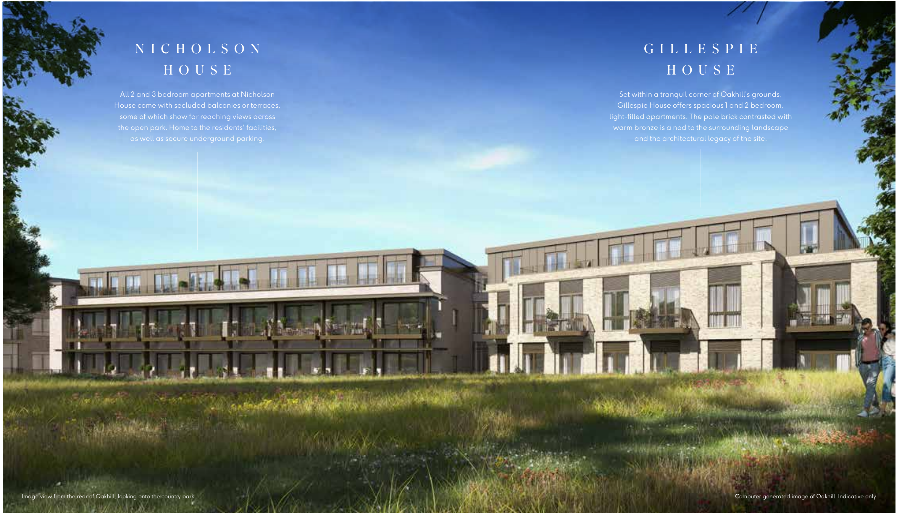
Image view from the rear of Oakhill, looking onto the country park.

Set within a tranquil corner of Oakhill's grounds, Gillespie House offers spacious 1 and 2 bedroom, light-filled apartments. The pale brick contrasted with warm bronze is a nod to the surrounding landscape and the architectural legacy of the site.