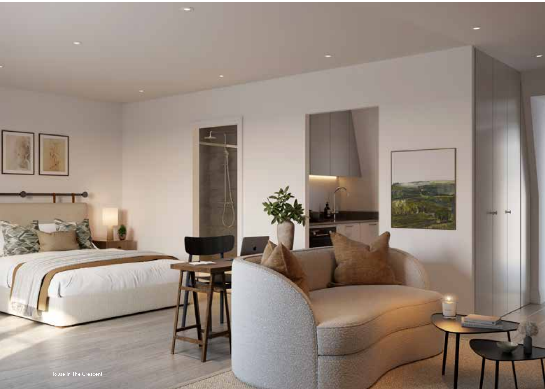
House in The Crescent.