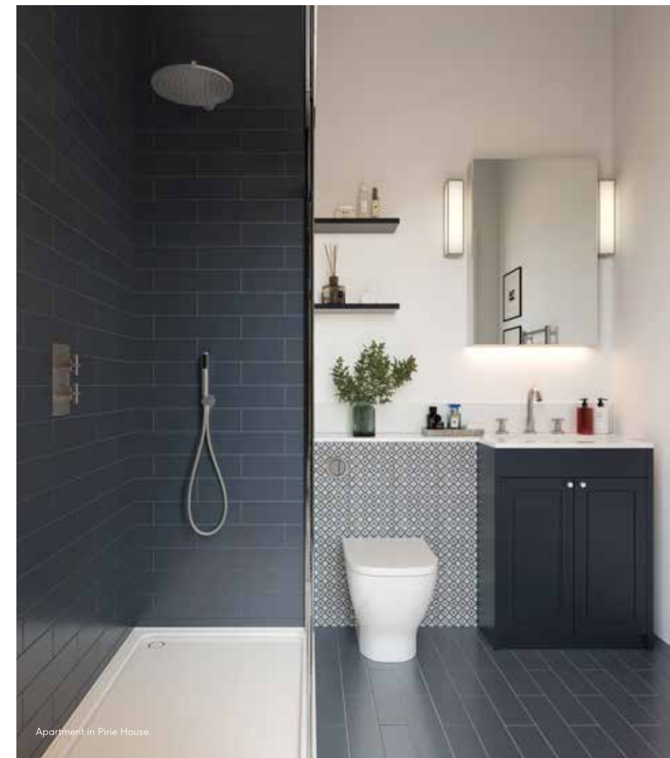
Apartment in Pirie House.

Computer generated images of Oakhill. Indicative only.