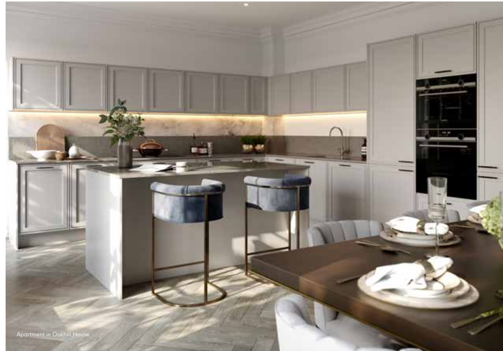
Apartment in Oakhill House.

Computer generated images of Oakhill. Indicative only.