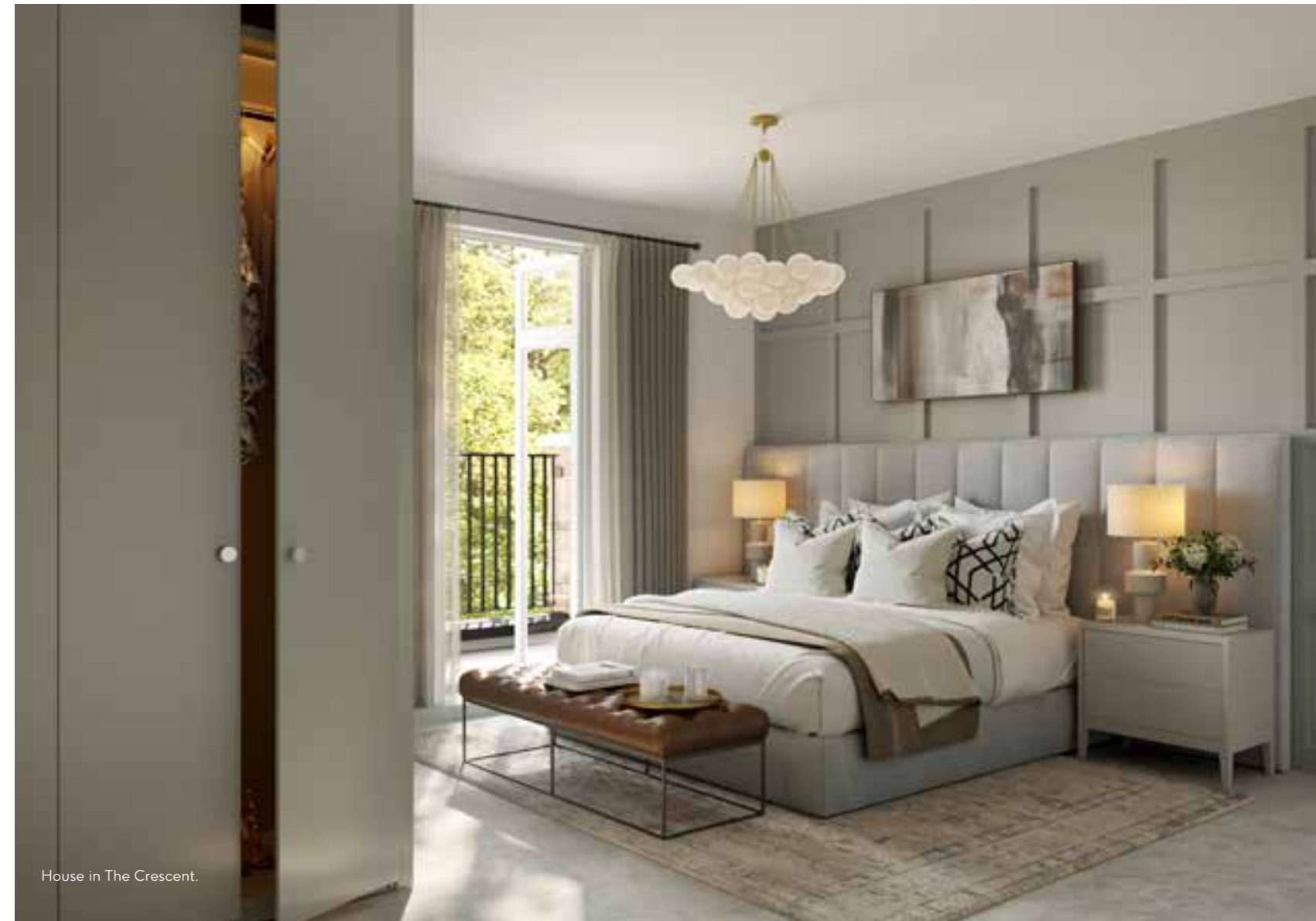
House in The Crescent.