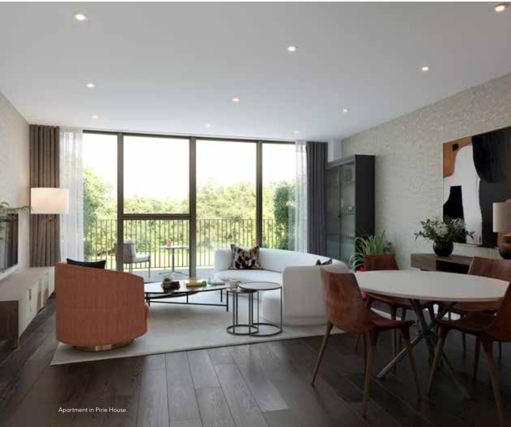
Apartment in Pirie House.