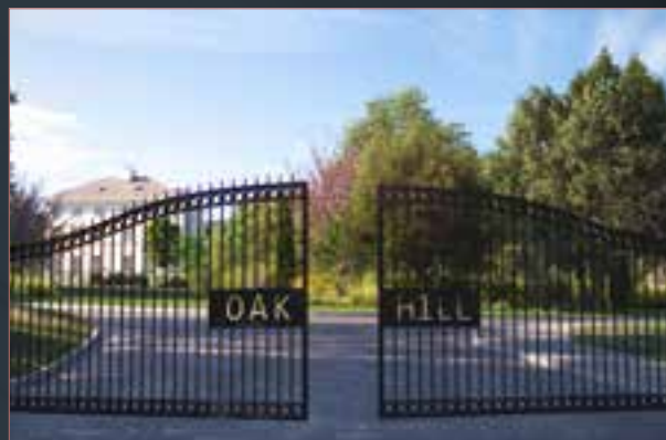
BRAND NEW GATED DEVELOPMENT.