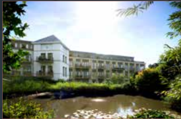
SET IN 30 ACRES OF BEAUTIFUL, MATURE LANDSCAPING WITH EXISTING PONDS.