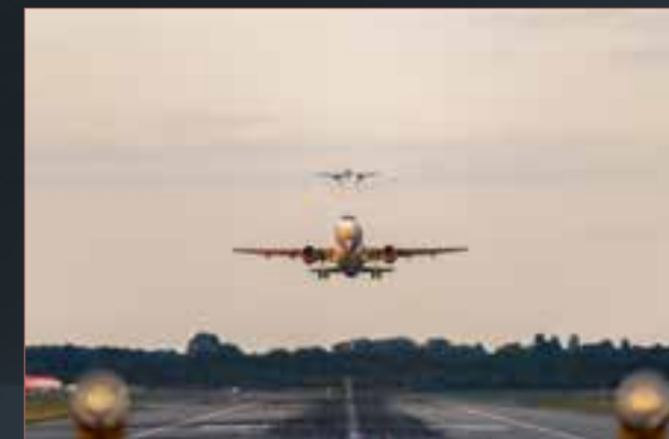
GREAT CONNECTIONS TO LONDON, GATWICK AIRPORT AND ASHFORD INTERNATIONAL.