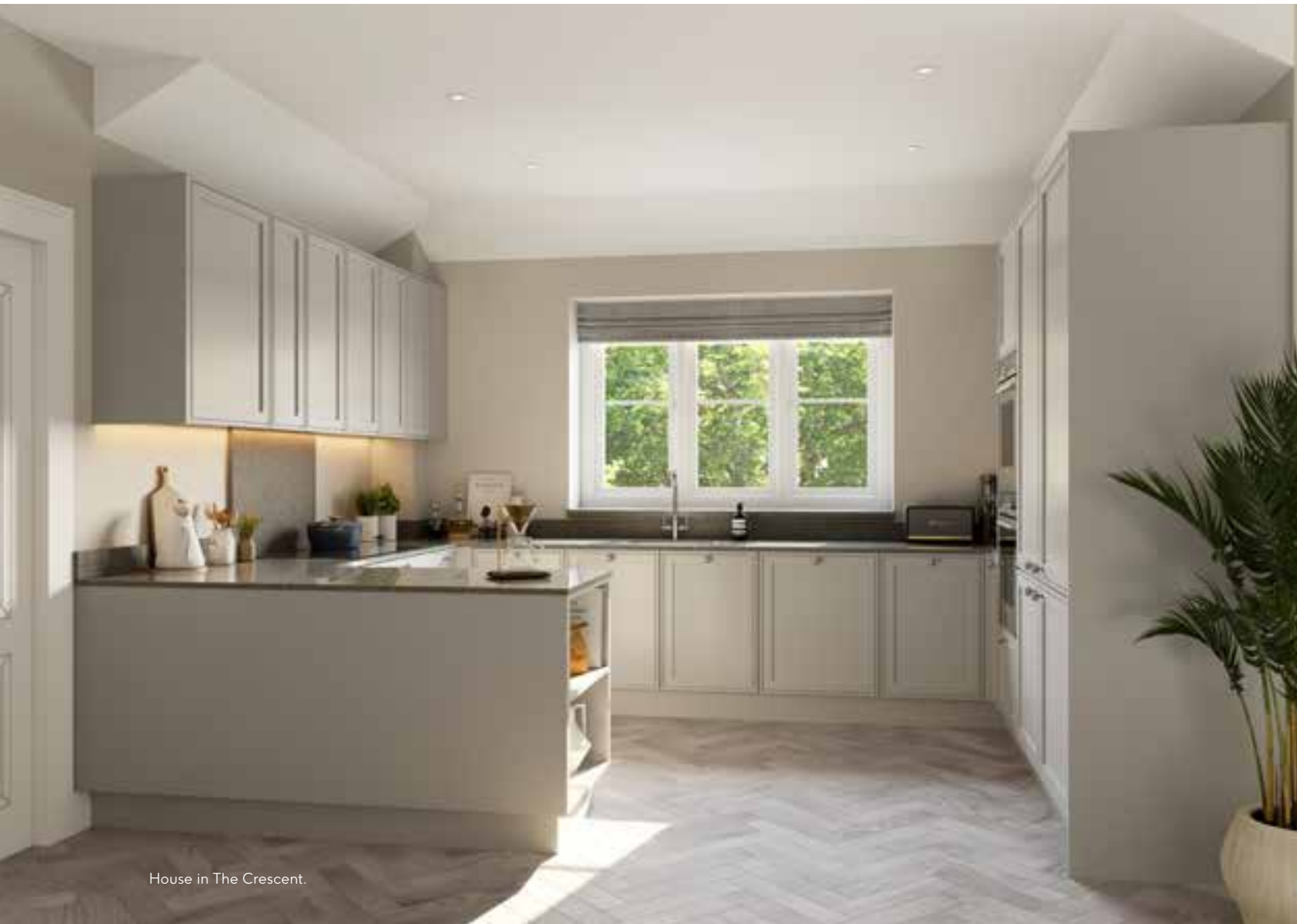
House in The Crescent.