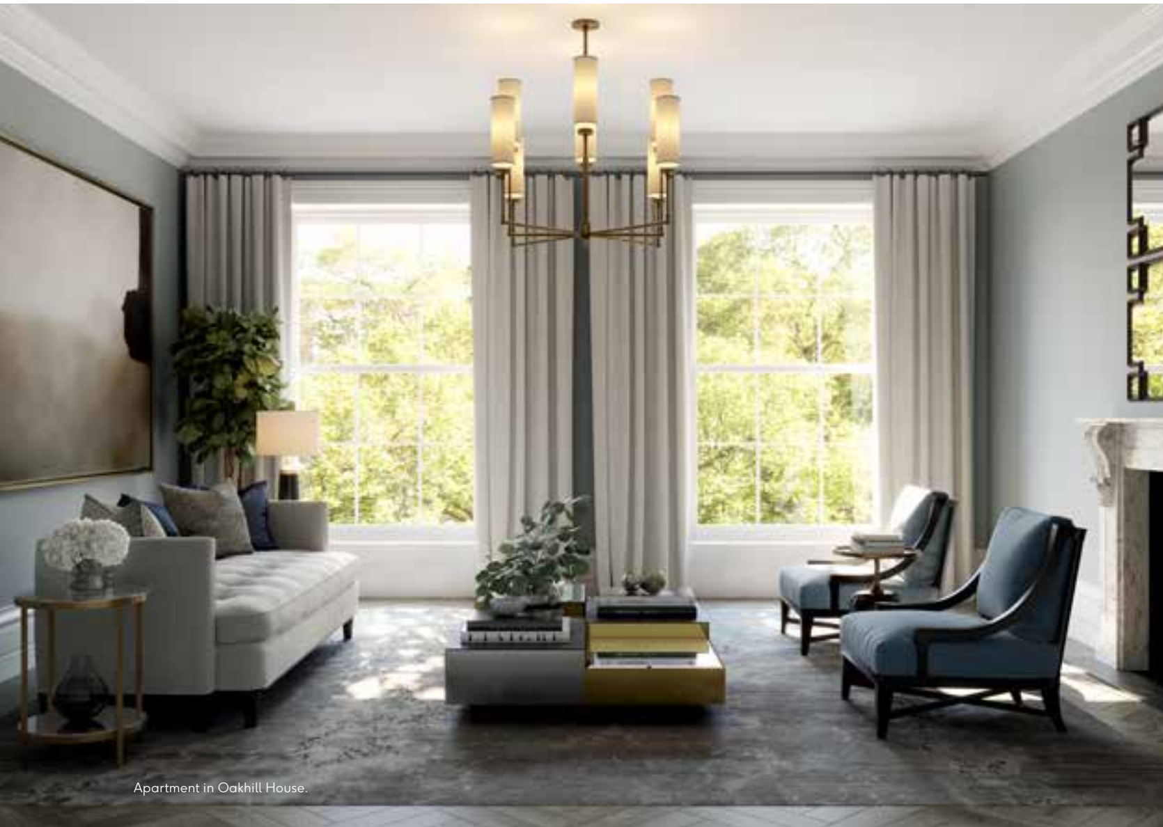
Apartment in Oakhill House.