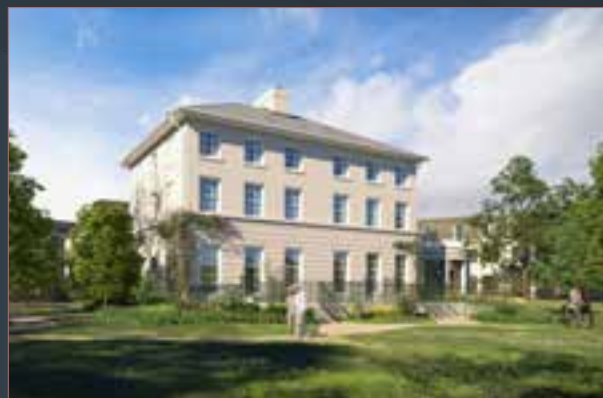
CONVERSION OF A GRADE II LISTED HISTORIC BUILDING AND NEW APARTMENTS.