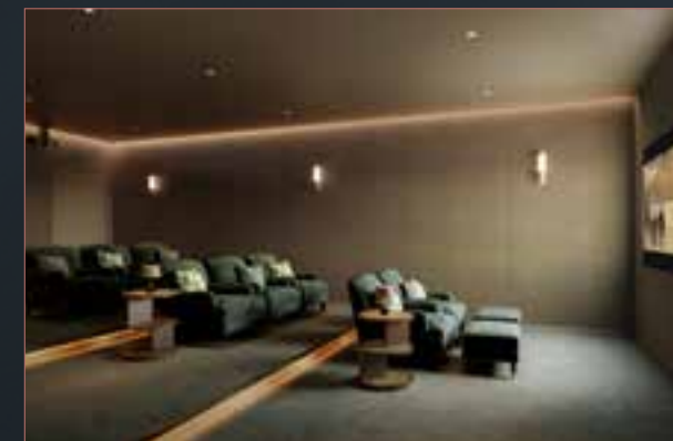
EXCLUSIVE RESIDENTS' FACILITIES.