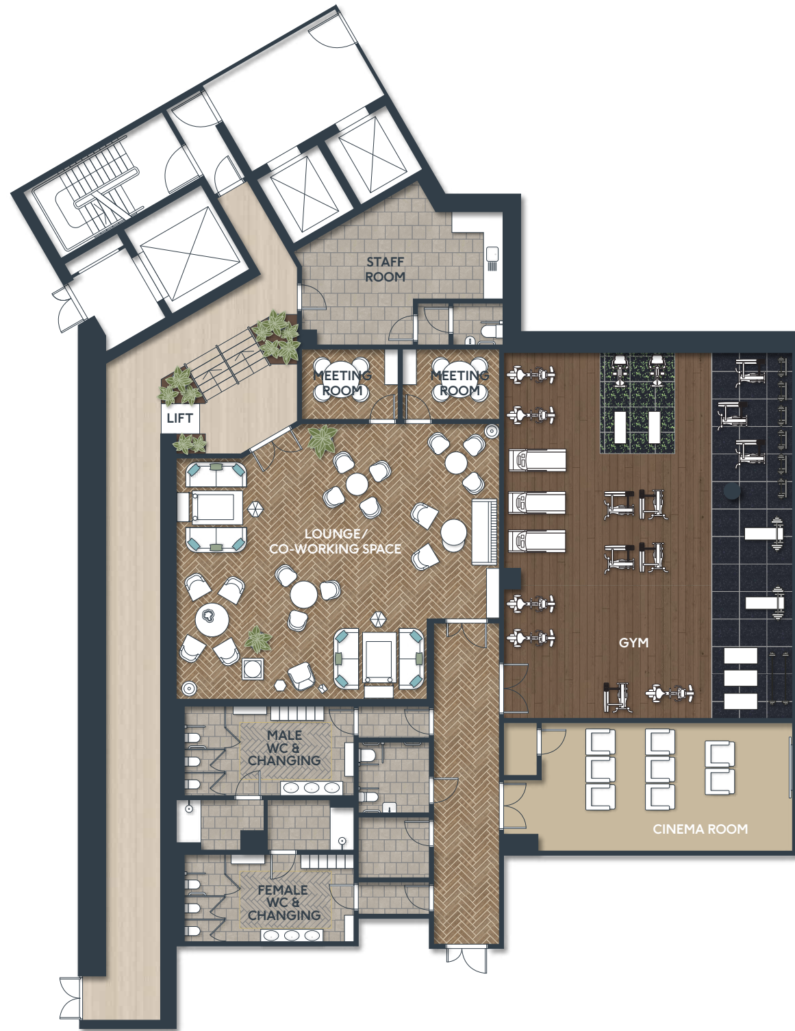
Computer generated plan. Indicative only.