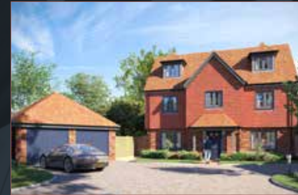
PRIVATE UNDERGROUND PARKING FOR APARTMENTS AND PRIVATE DRIVEWAY PARKING FOR HOUSES.