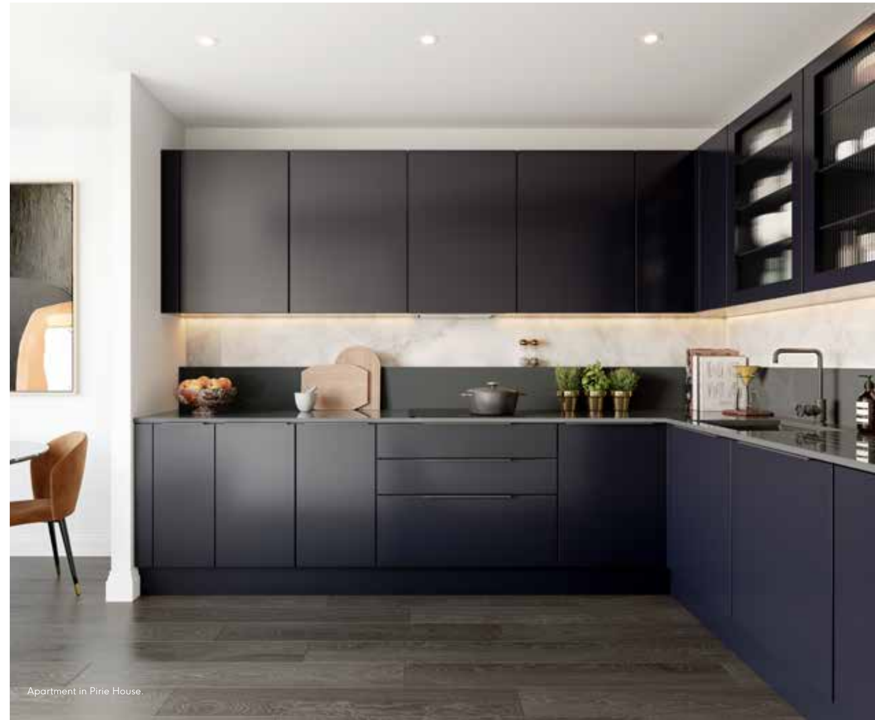
Apartment in Pirie House.

Computer generated images of Oakhill. Indicative only.