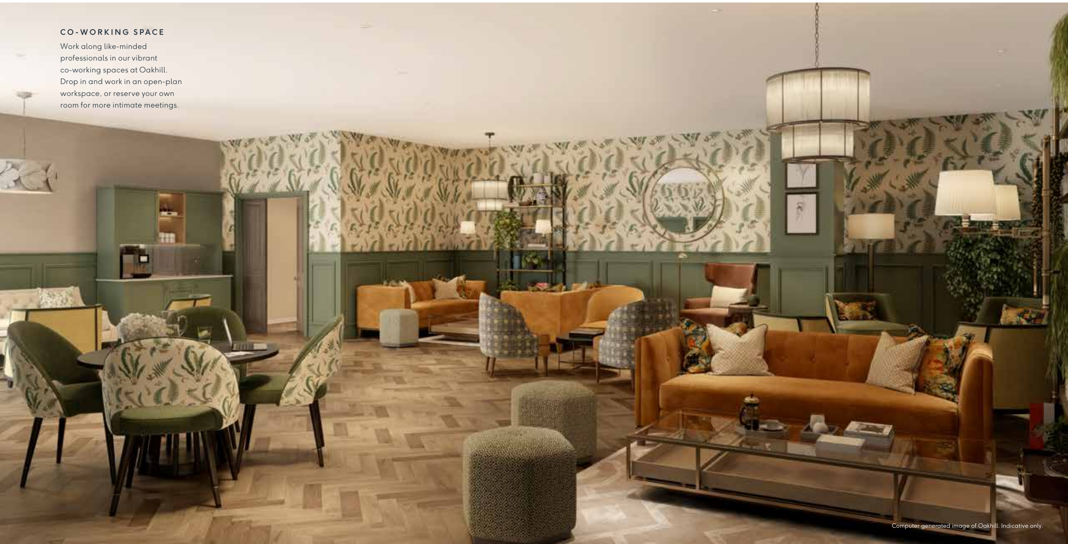
Computer generated image of Oakhill. Indicative only.

Work along like-minded professionals in our vibrant co-working spaces at Oakhill. Drop in and work in an open-plan workspace, or reserve your own room for more intimate meetings.