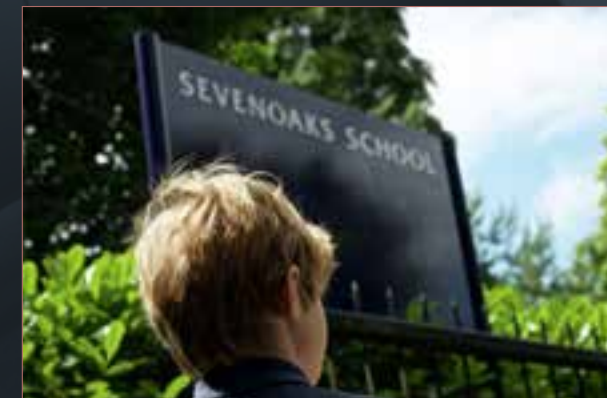
EXCELLENT SCHOOL CATCHMENT AREA INCLUDING TONBRIDGE AND SEVENOAKS SCHOOL.