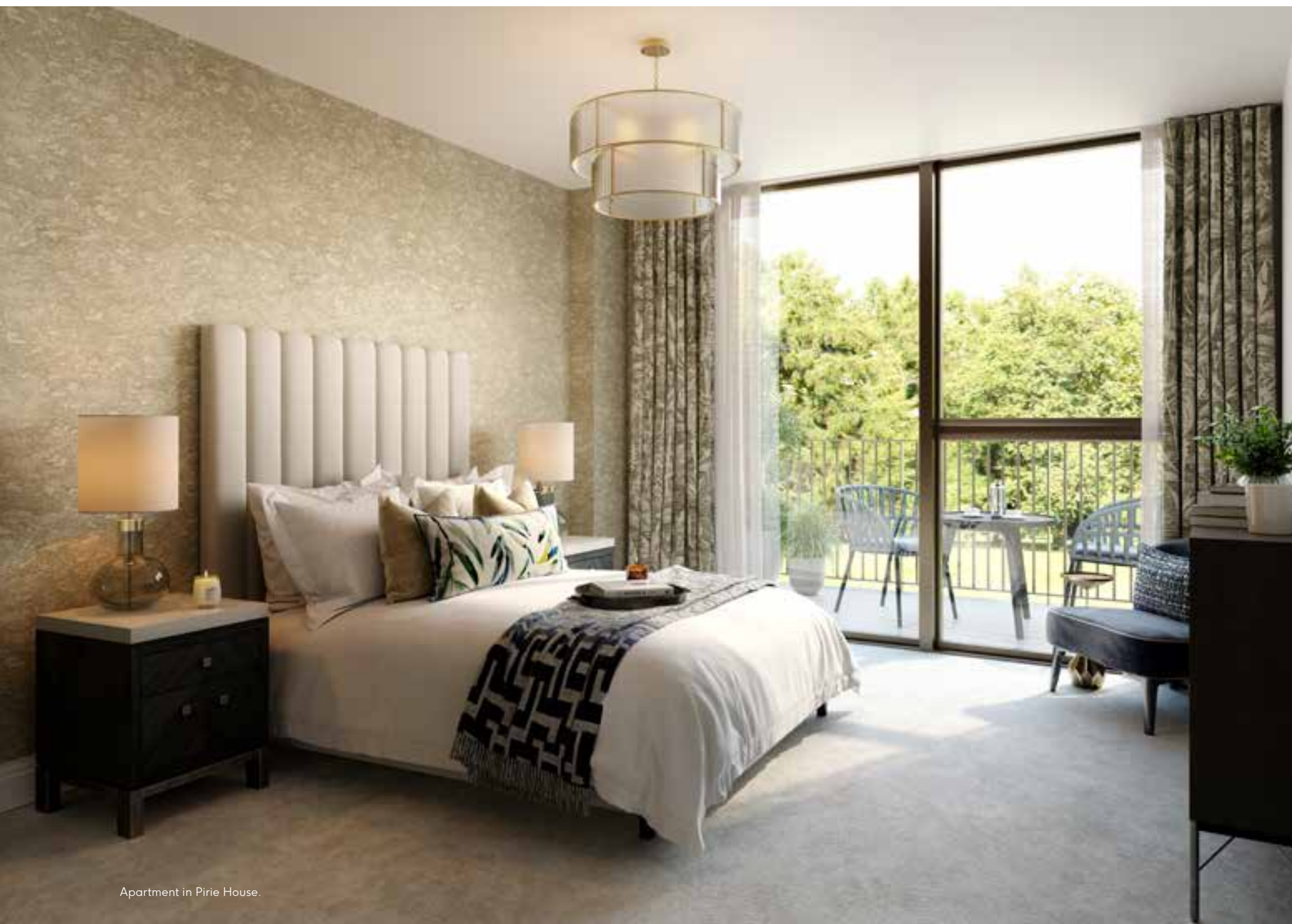
Apartment in Pirie House.