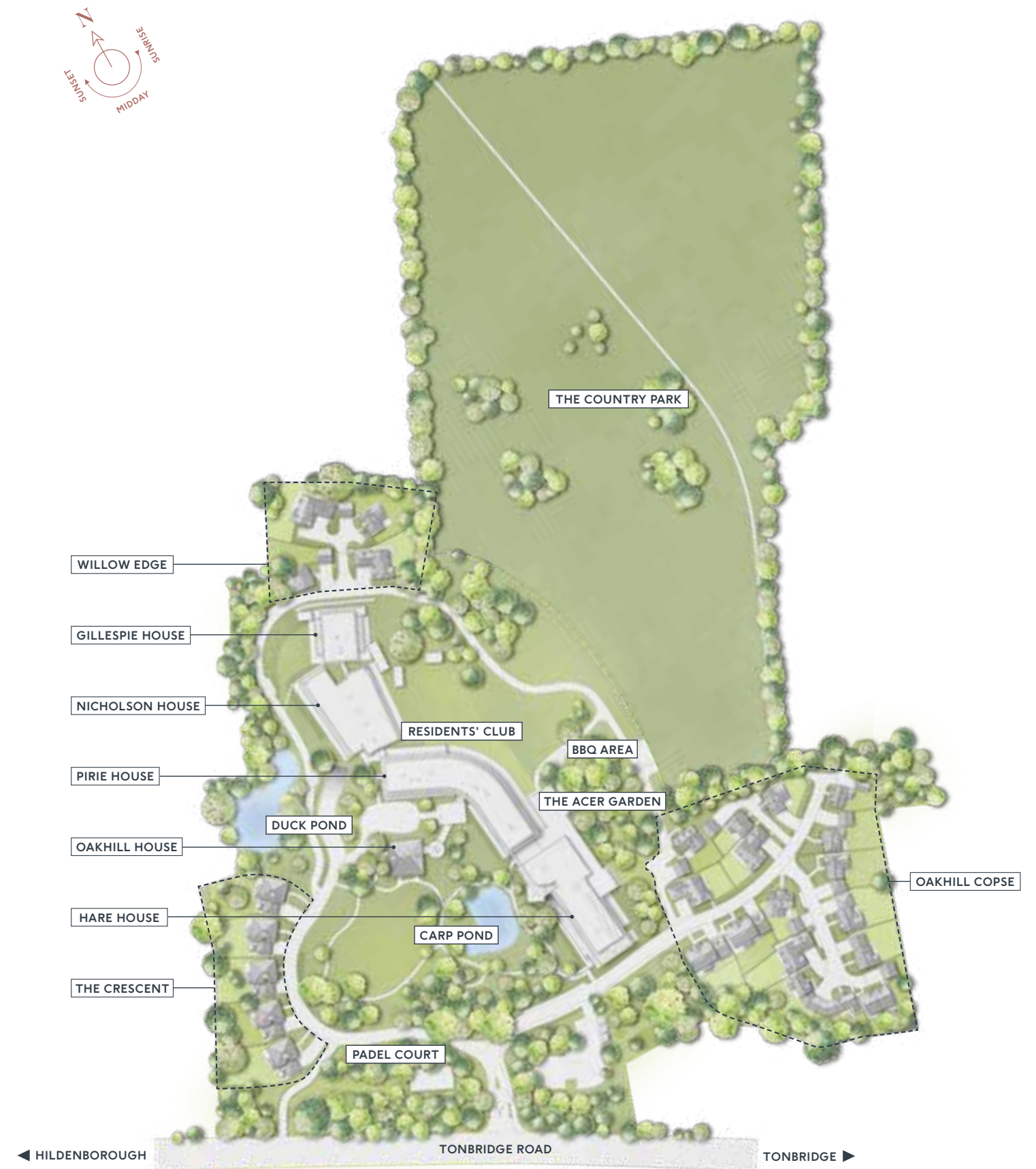
Computer generated map of Oakhill. Indicative only.

From the secluded woodlands to the Kentish countryside beyond, the natural world is front of stage at Oakhill. It's an evolving theatre of changing seasons, flourishing wildlife, and blossoming landscape. Step out of your home into a sanctuary of tended grounds, pull back the curtain and unveil a vibrant palette of greens. With a large country park, picturesque ponds, and mature woodlands as your neighbours, the view from your home is a pure delight.