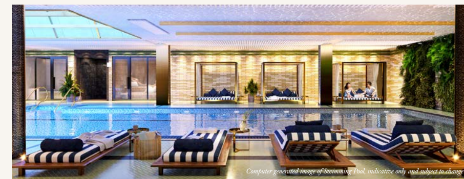
Computer generated image of Swimming Pool, indicative only and subject to change.

Located within six acres of landscaping including a public park, central square and private residents' gardens.