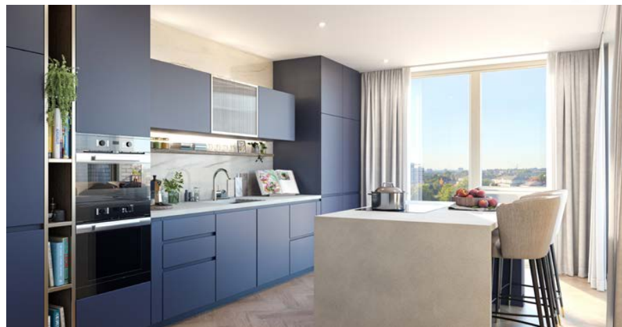
Computer generated image at King's Road Park, indicative only and subject to change.