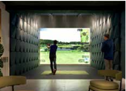
Computer generated images at King's Road Park, indicative only and subject to change.

*Please ask a Sales Advisor for more details