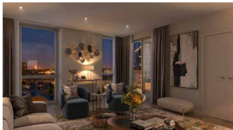
Computer generated image of King's Road Park, indicative only and subject to change.