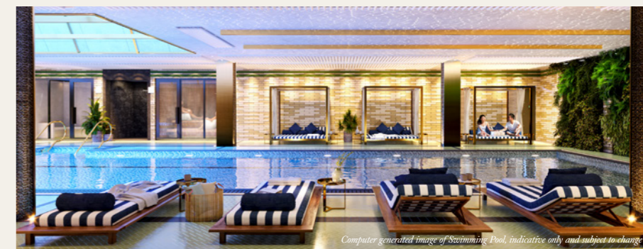
Computer generated image of Swimming Pool, indicative only and subject to change.

Located within six acres of landscaping including a public park, central square and private residents' gardens.