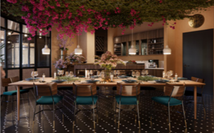
Computer generated image of dining room, indicative only and subject to change.