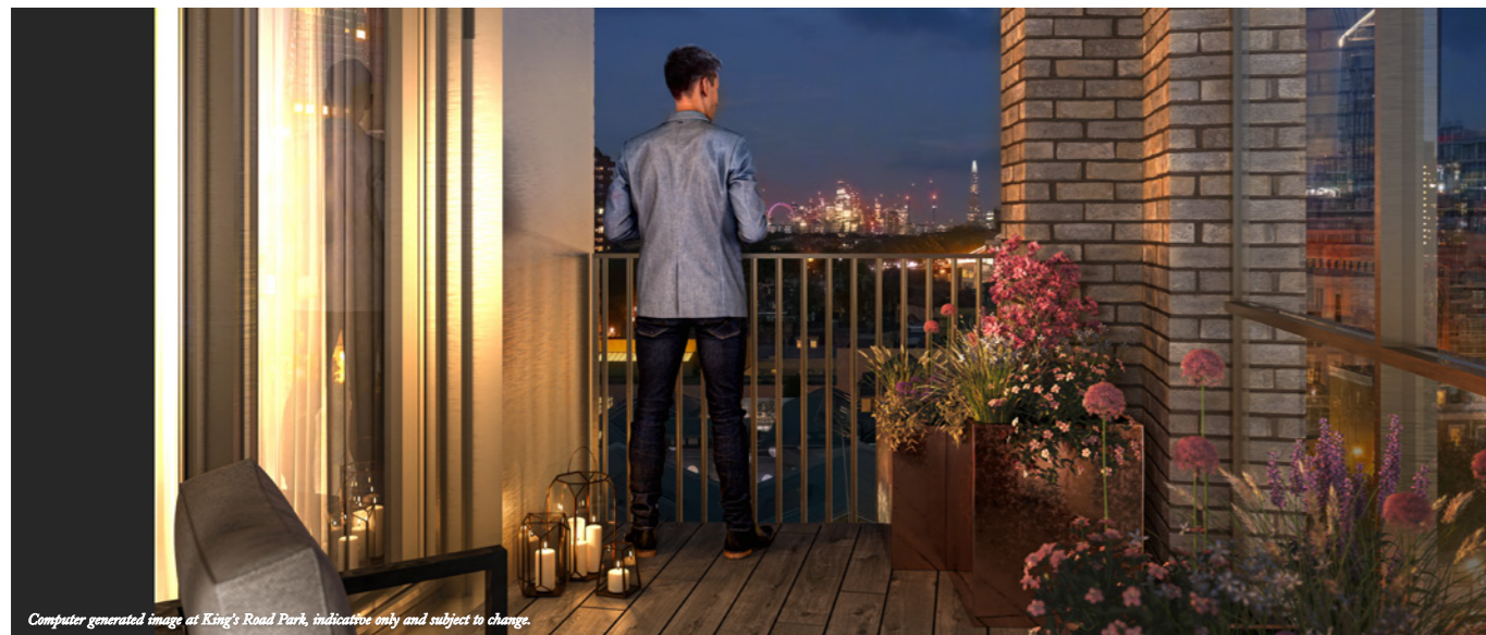
Computer generated image at King's Road Park, indicative only and subject to change.