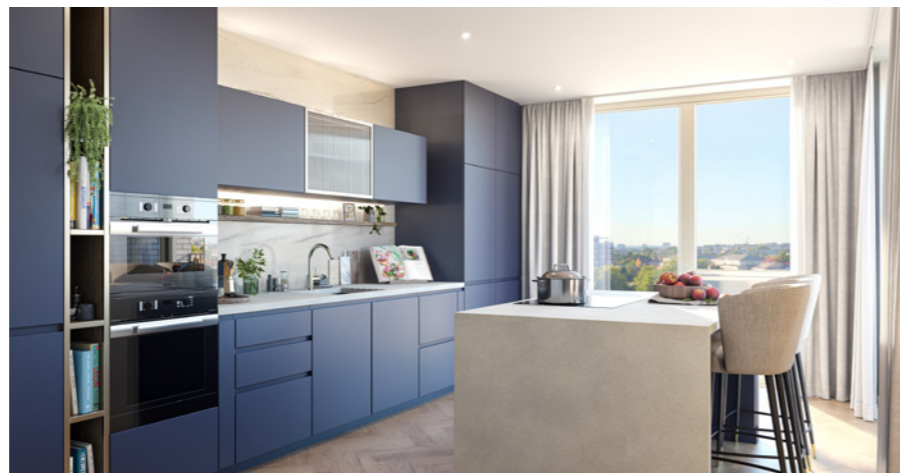
Computer generated image at King's Road Park, indicative only and subject to change.