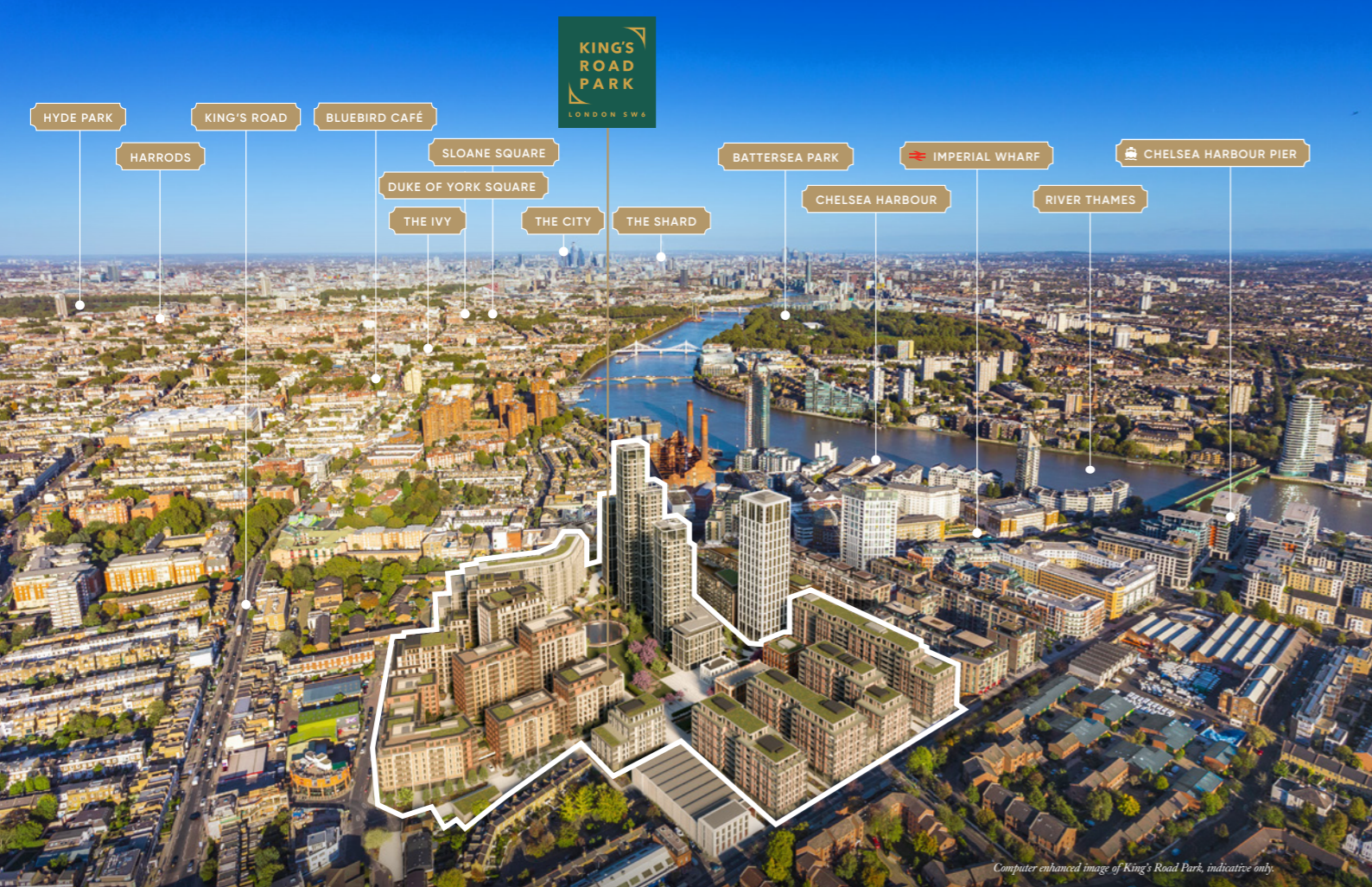
Computer enhanced image of King's Road Park, indicative only.