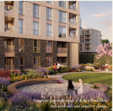
Computer generated image of King's Road Park, indicative only and subject to change.