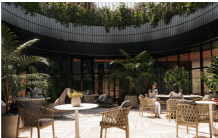
Computer generated image of Atrium, indicative only and subject to change.