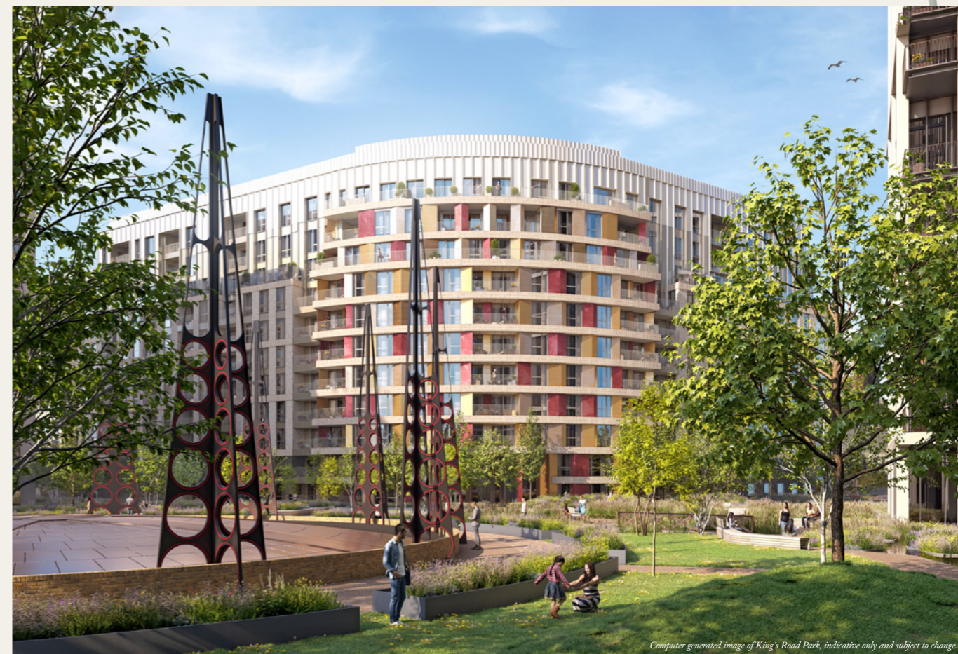
Computer generated image of King's Road Park, indicative only and subject to change.