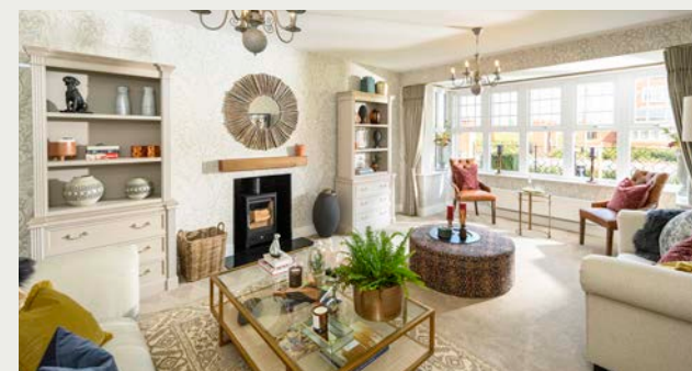
Photography represents the Briar Showhome and is indicative only.