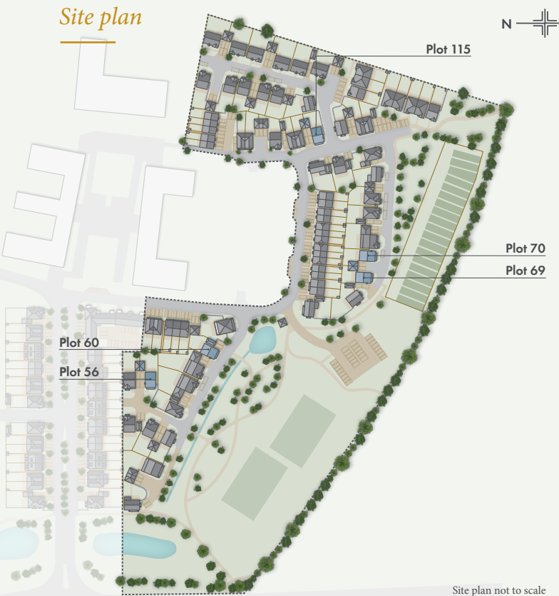
Site plan not to scale