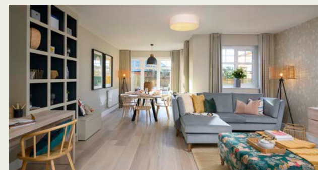
Photography represents the Primrose Showhome and is indicative only.