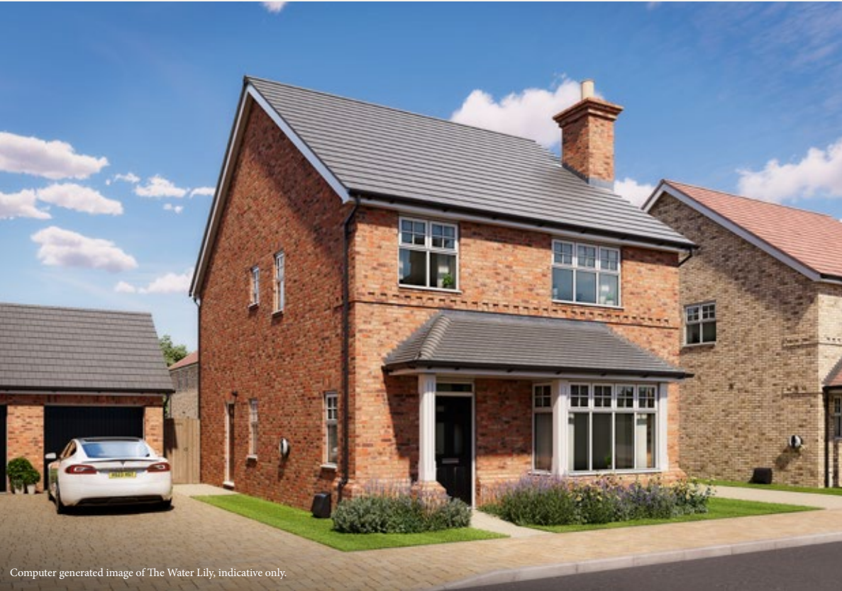
Computer generated image of The Water Lily, indicative only.