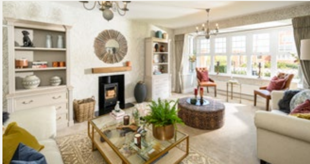
Photography represents the Briar Showhome, indicative only.