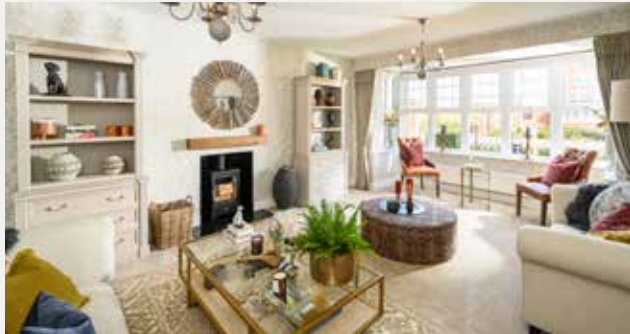
Photography represents the Briar Showhome, indicative only.