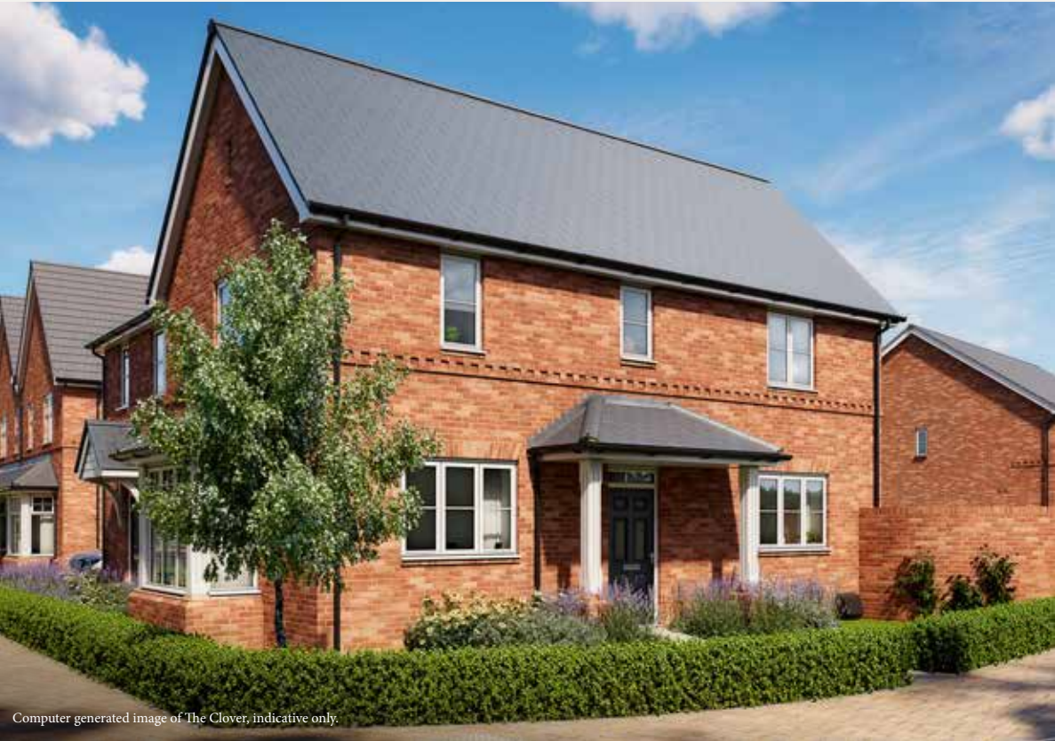
Computer generated image of The Clover, indicative only.