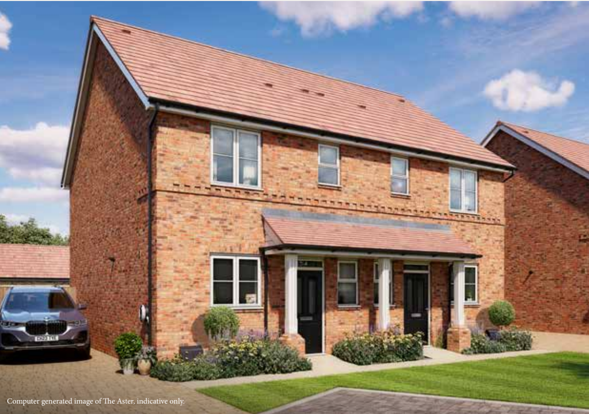
Computer generated image of The Aster, indicative only.