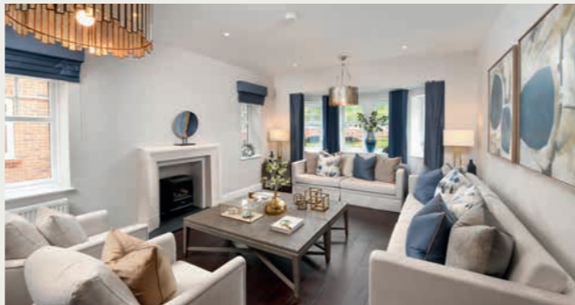
Image from previous St Edward development, indicative only