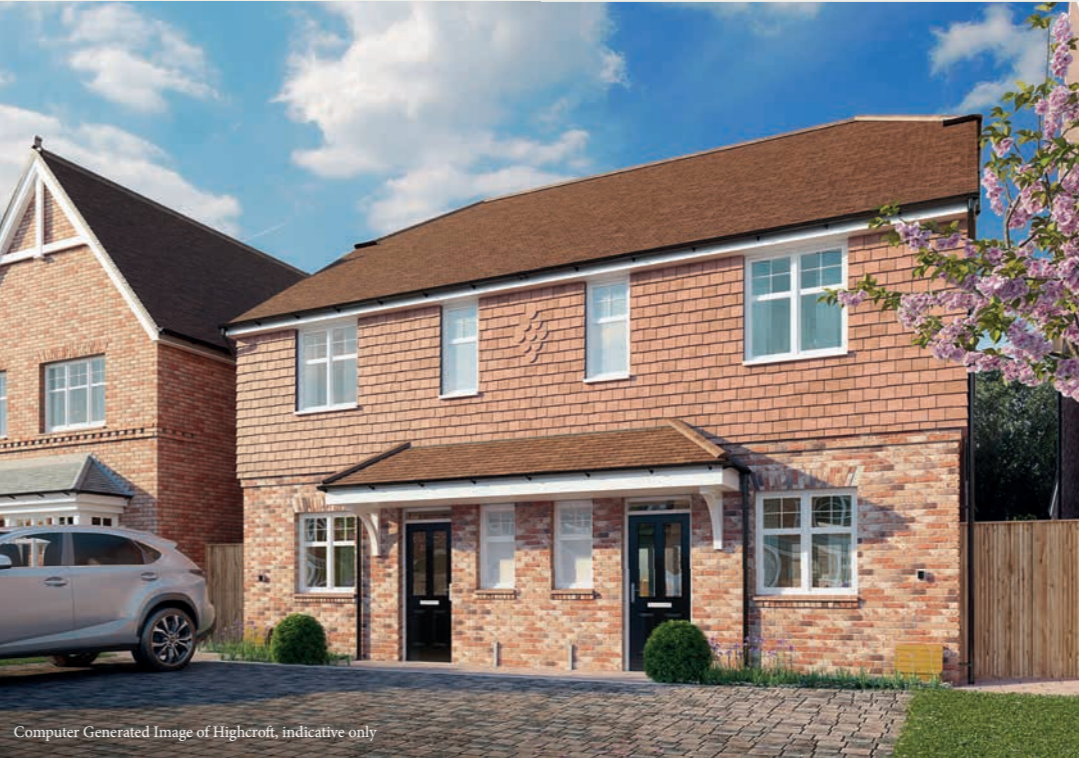
Computer Generated Image of Highcroft, indicative only