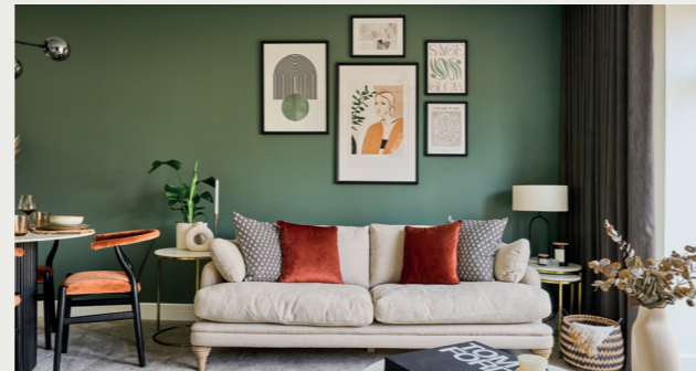
Photography represents The Violet show home and is indicative only.