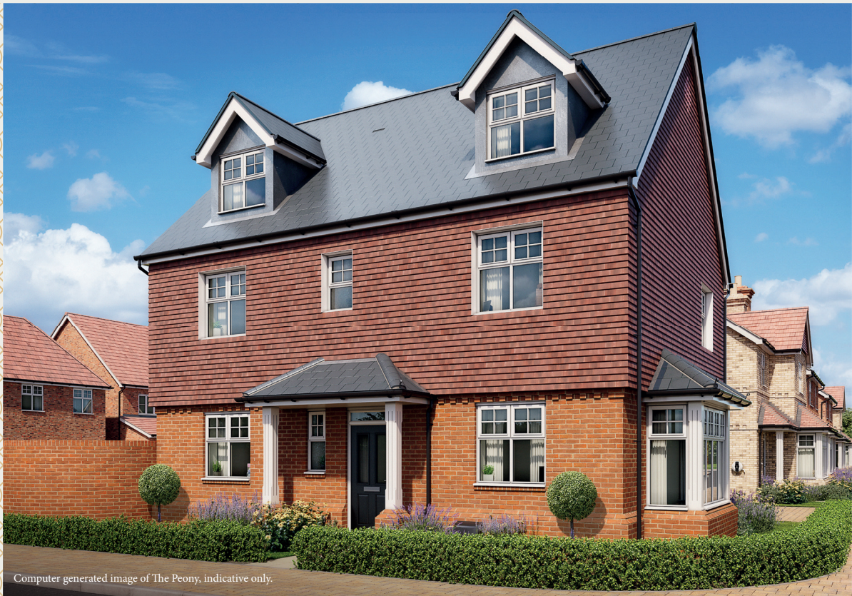
Computer generated image of The Peony, indicative only.