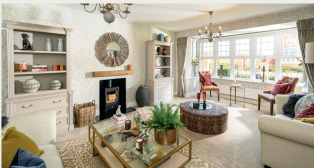
Photography represents the Briar Showhome, indicative only.