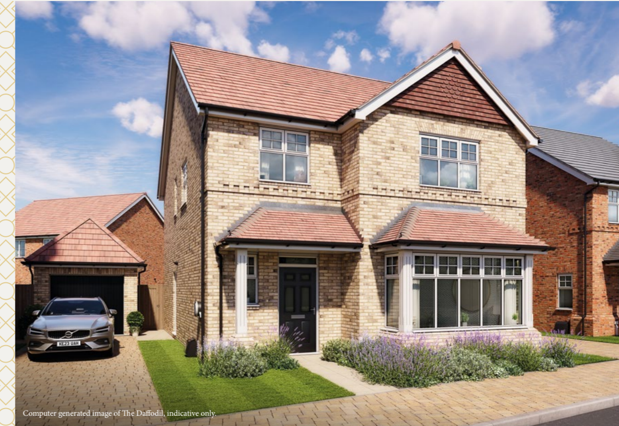
Computer generated image of The Daffodil, indicative only.