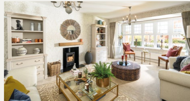
Photography represents the Briar Showhome, indicative only.