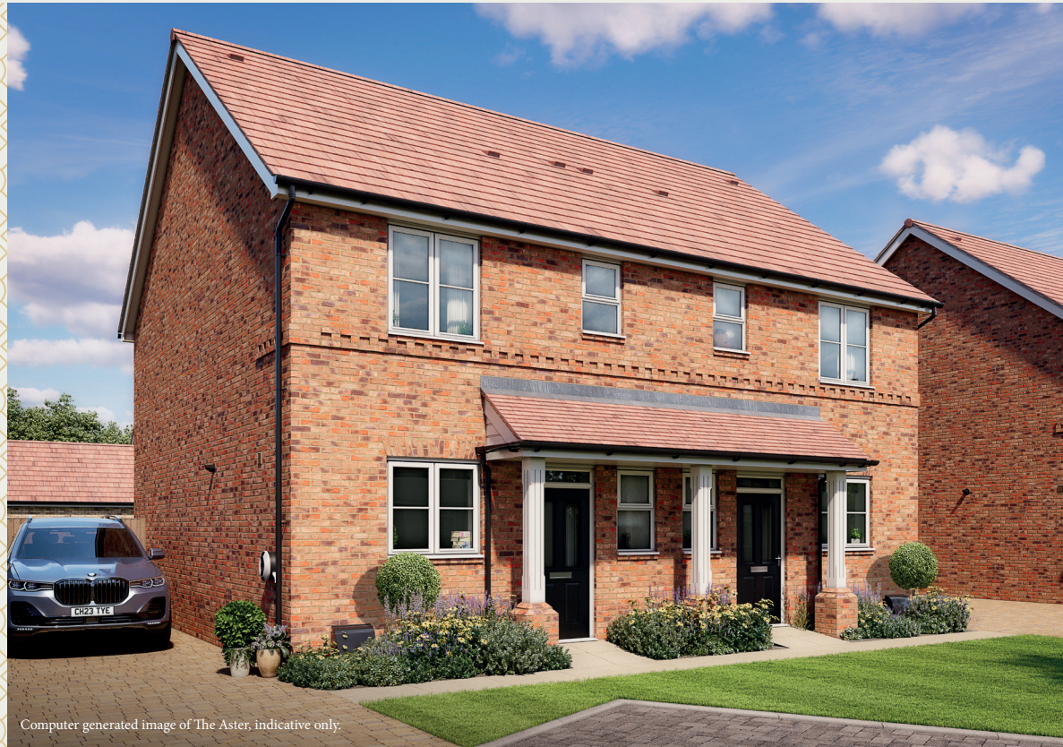
Computer generated image of The Aster, indicative only.