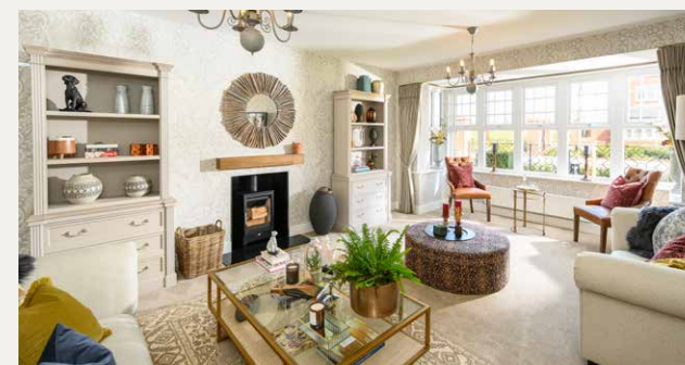
Photography represents the Briar Showhome, indicative only.