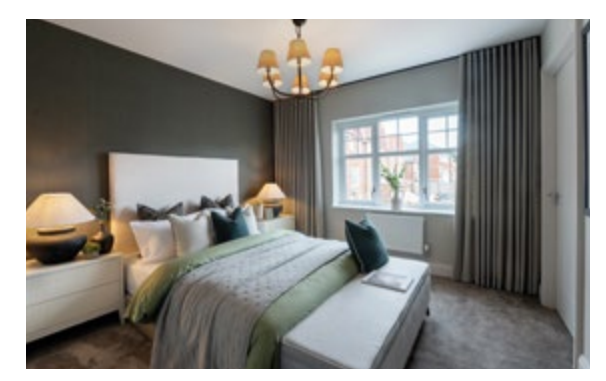
Photography is indicative only