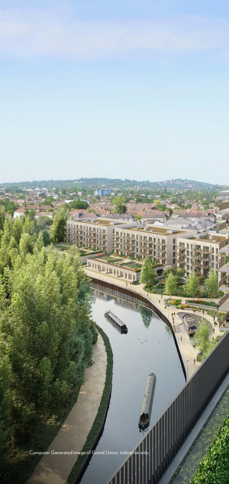
Computer Generated image of Grand Union, indicative only