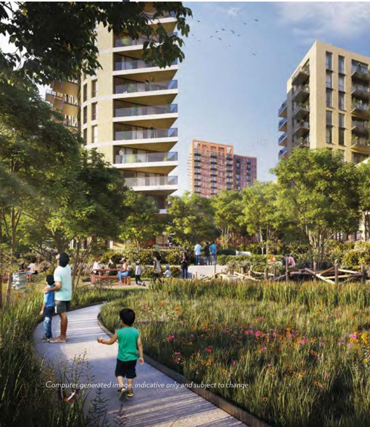
Computer generated image, indicative only and subject to change

Journey times from Grand Union Train times from Stonebridge Park (SP) ZONE 3 or Alpertons (A) ZONE 4