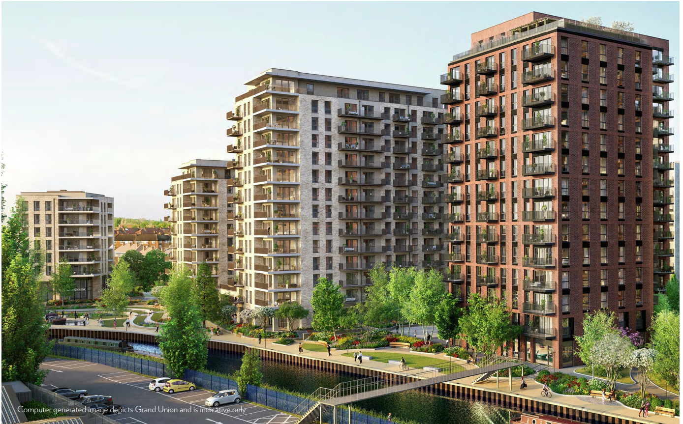
Computer generated image depicts Grand Union and is indicative only