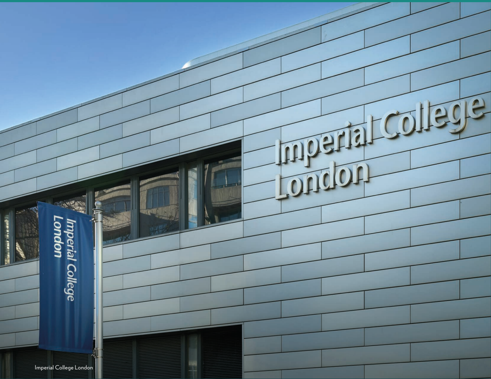
Imperial College London

Middlesex University Hendon Campus The Burroughs, London NW4 4BT