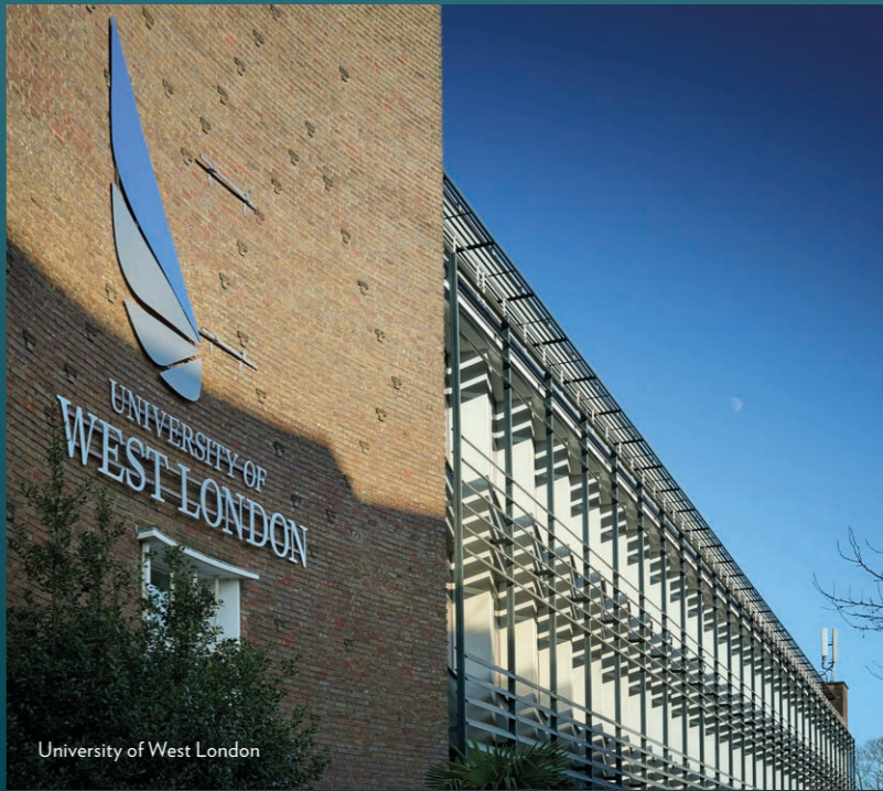
University of West London