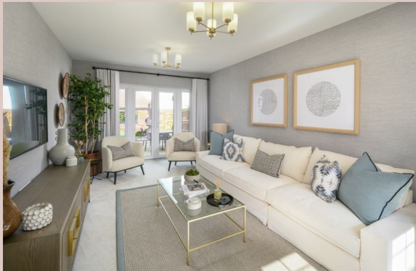
Interior photography is of the Foal Hurst Green show home and is indicative only.

Berkeley Foal Hurst Green Sales and Marketing Suite Badsell Road Paddock Wood TN12 6LP Open daily 10am – 5pm