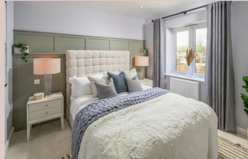
Interior photography is of the Foal Hurst Green show home and is indicative only.

Berkeley Foal Hurst Green Sales and Marketing Suite Badsell Road Paddock Wood TN12 6LP Open daily 10am – 5pm