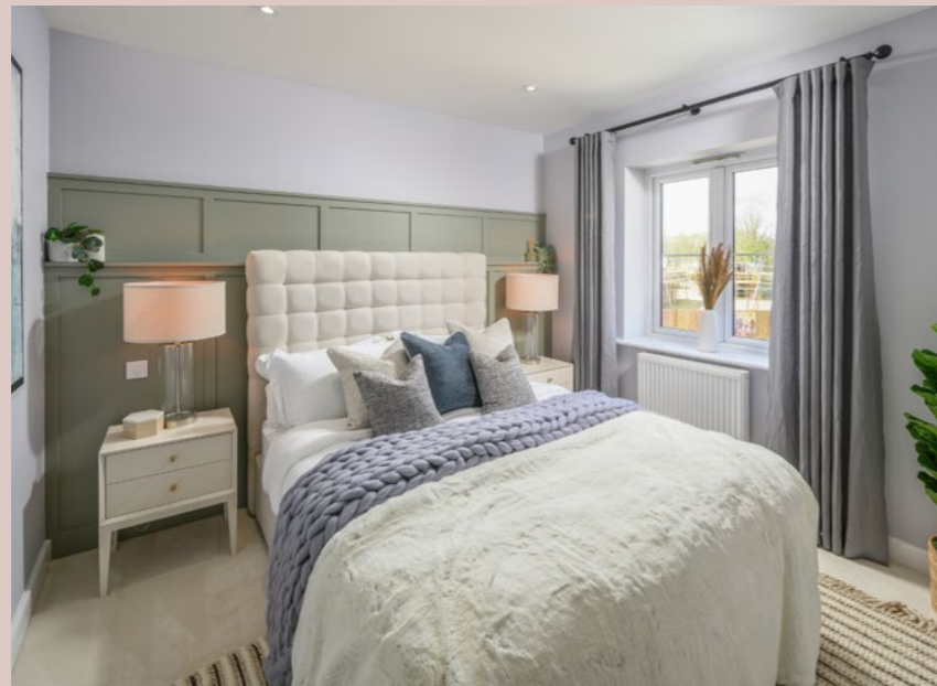
Interior photography is of the Foal Hurst Green show home and is indicative only.

Berkeley Foal Hurst Green Sales and Marketing Suite Badsell Road Paddock Wood TN12 6LP Open daily 10am – 5pm