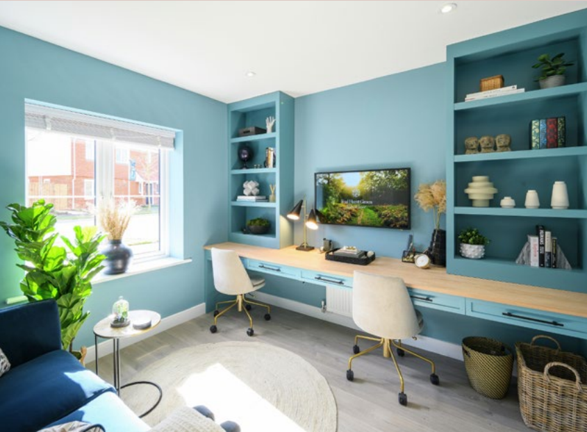
Interior photography is of the Foal Hurst Green show home and is indicative only.

Berkeley Foal Hurst Green Sales and Marketing Suite Badsell Road Paddock Wood TN12 6LP Open daily 10am – 5pm