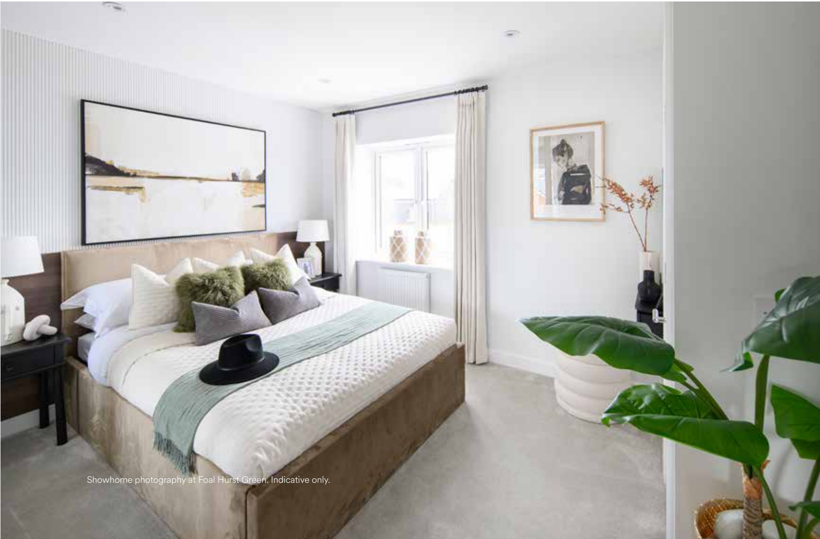
Showhome photography at Foal Hurst Green. Indicative only.