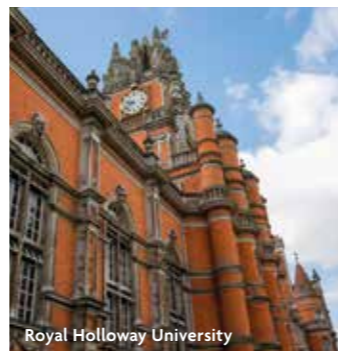
Royal Holloway University

Founded in 1886 and ranked one of the UK's top 20 universities, Royal Holloway is only 3.1 miles away from Eden Grove.