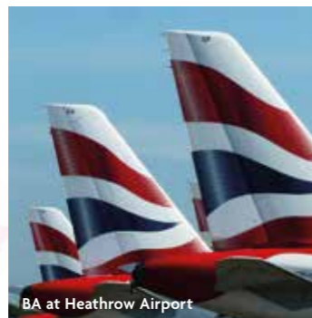
BA at Heathrow Airport

THE AIRPORT SUPPORTS 76,000 JOBS GENERATED BY OVER 400 COMPANIES