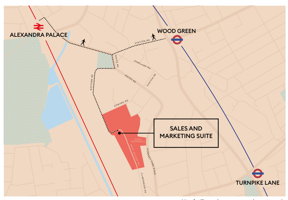
Map for illustration purposes only, not to scale