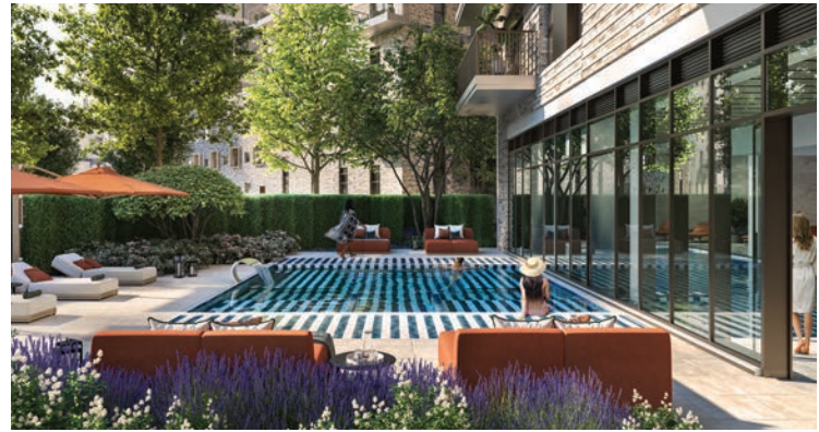
Computer-generated images and lifestyle images are indicative only.