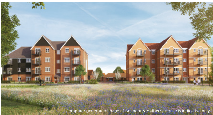
Computer generated image of Belmont & Mulberry House is indicative only.

Renowned for its choice of outstanding schools, High Wycombe is a thriving market town currently undergoing a significant regeneration programme, which will see the town centre reshaped with new public spaces and new opportunities for economic growth.