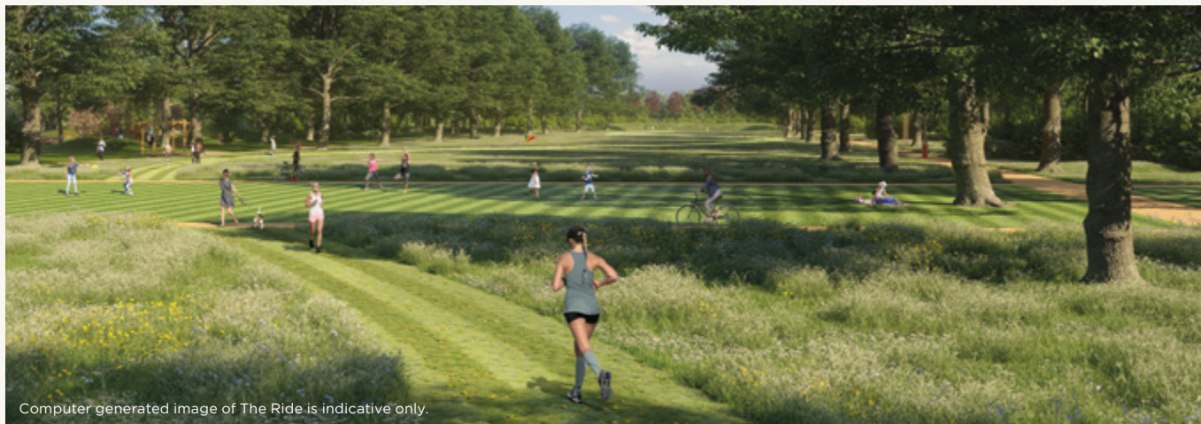
Computer generated image of The Ride is indicative only.