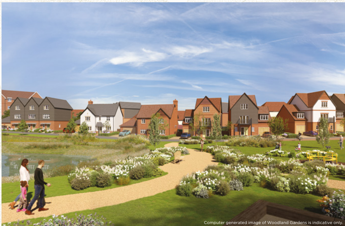
Computer generated image of Woodland Gardens is indicative only.