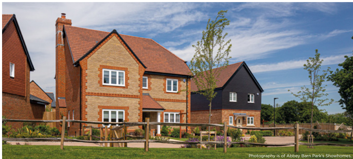
Photography is of Abbey Barn Park's Showhomes.