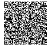
DORSETT HOUSE APARTMENTS