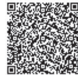
BELMONT HOUSE AND MULBERRY HOUSE APARTMENTS