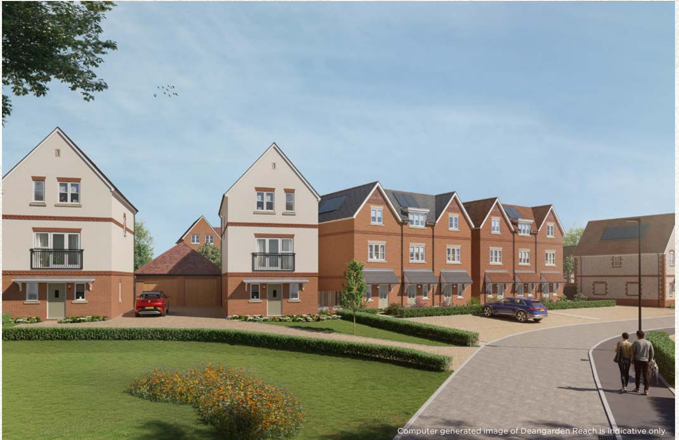
Computer generated image of Deangarden Reach is indicative only.