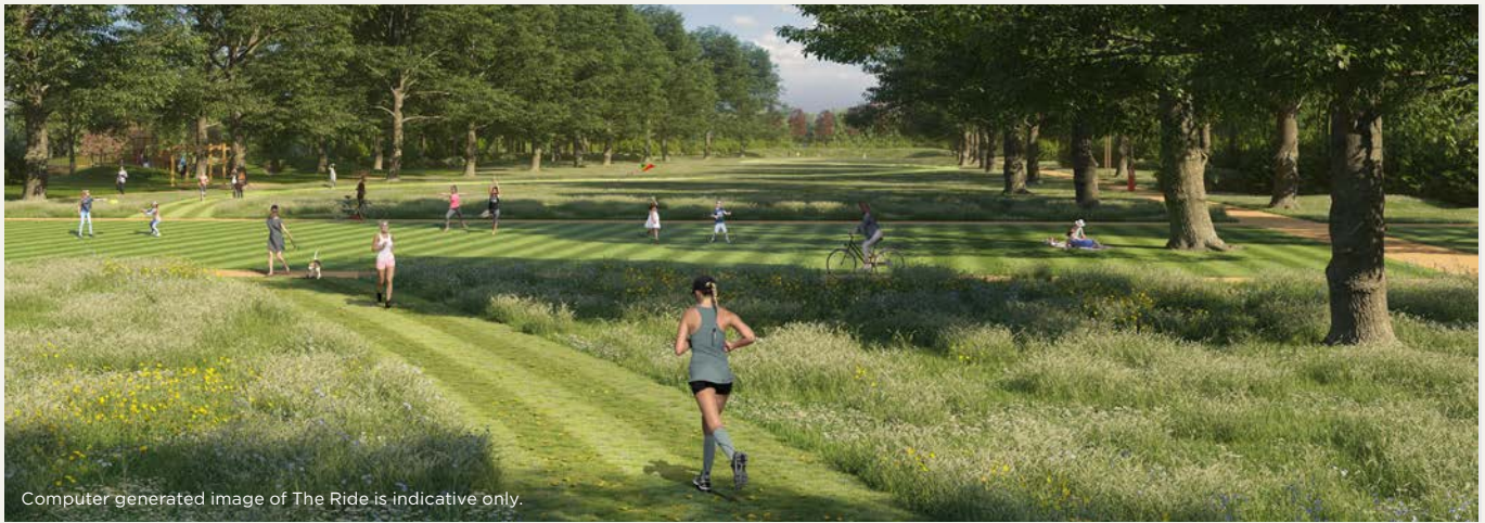
Computer generated image of The Ride is indicative only.