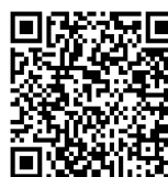
DEANGARDEN REACH HOUSES