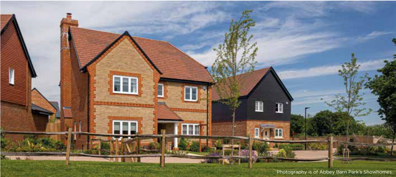
Photography is of Abbey Barn Park's Showhomes.