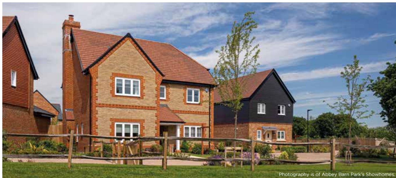
Photography is of Abbey Barn Park's Showhomes.