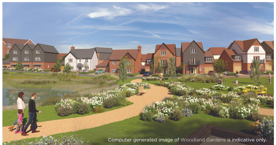
Computer generated image of Woodland Gardens is indicative only.

Renowned for its choice of outstanding schools, High Wycombe is a thriving market town currently undergoing a significant regeneration programme, which will see the town centre reshaped with new public spaces and new opportunities for economic growth.