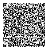
BELMONT HOUSE AND MULBERRY HOUSE APARTMENTS