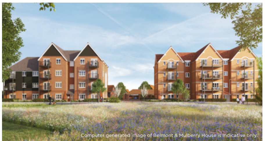
Computer generated image of Belmont & Mulberry House is indicative only.

Renowned for its choice of outstanding schools, High Wycombe is a thriving market town currently undergoing a significant regeneration programme, which will see the town centre reshaped with new public spaces and new opportunities for economic growth.