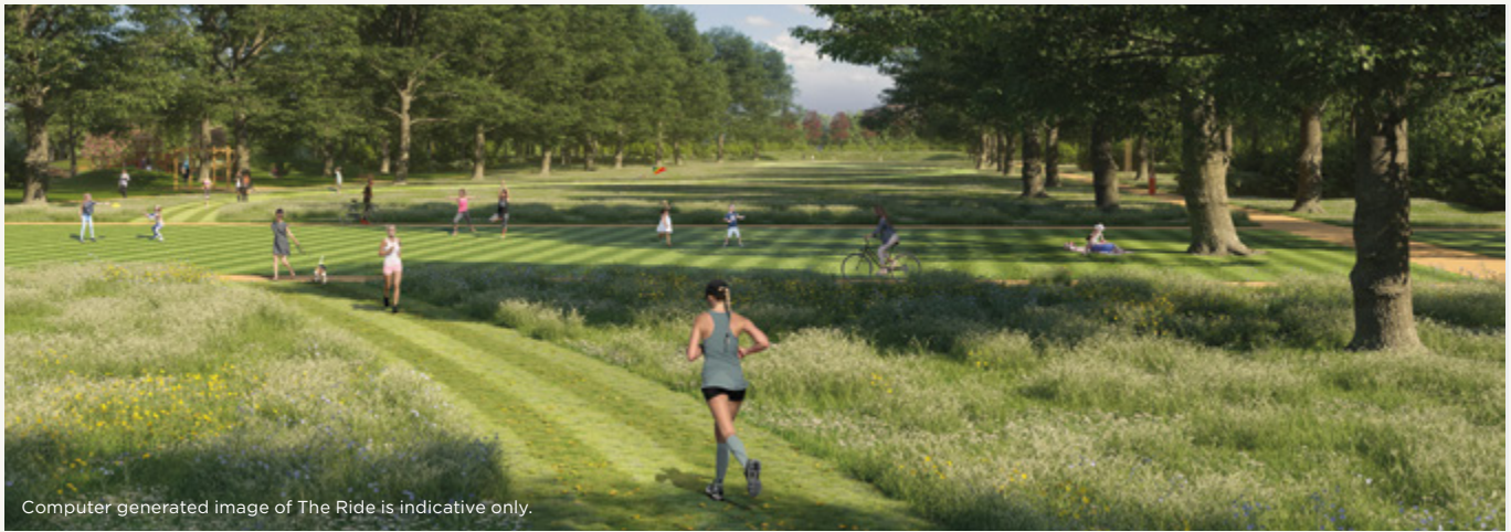
Computer generated image of The Ride is indicative only.